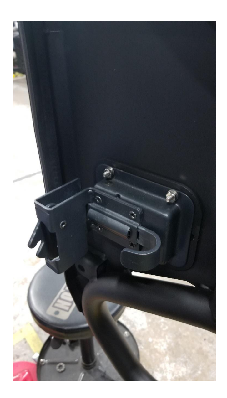
Figure1: front door latch orientation