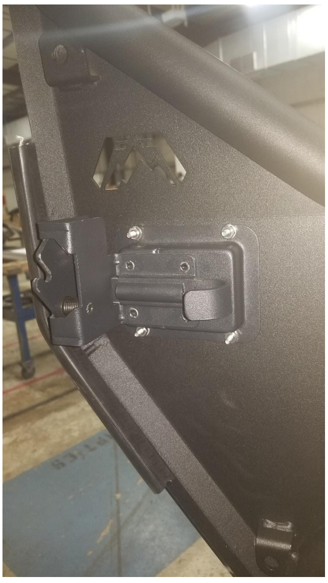
Figure1: rear door latch orientation

Product Number: JL1031 2018-2020 Jeep JL