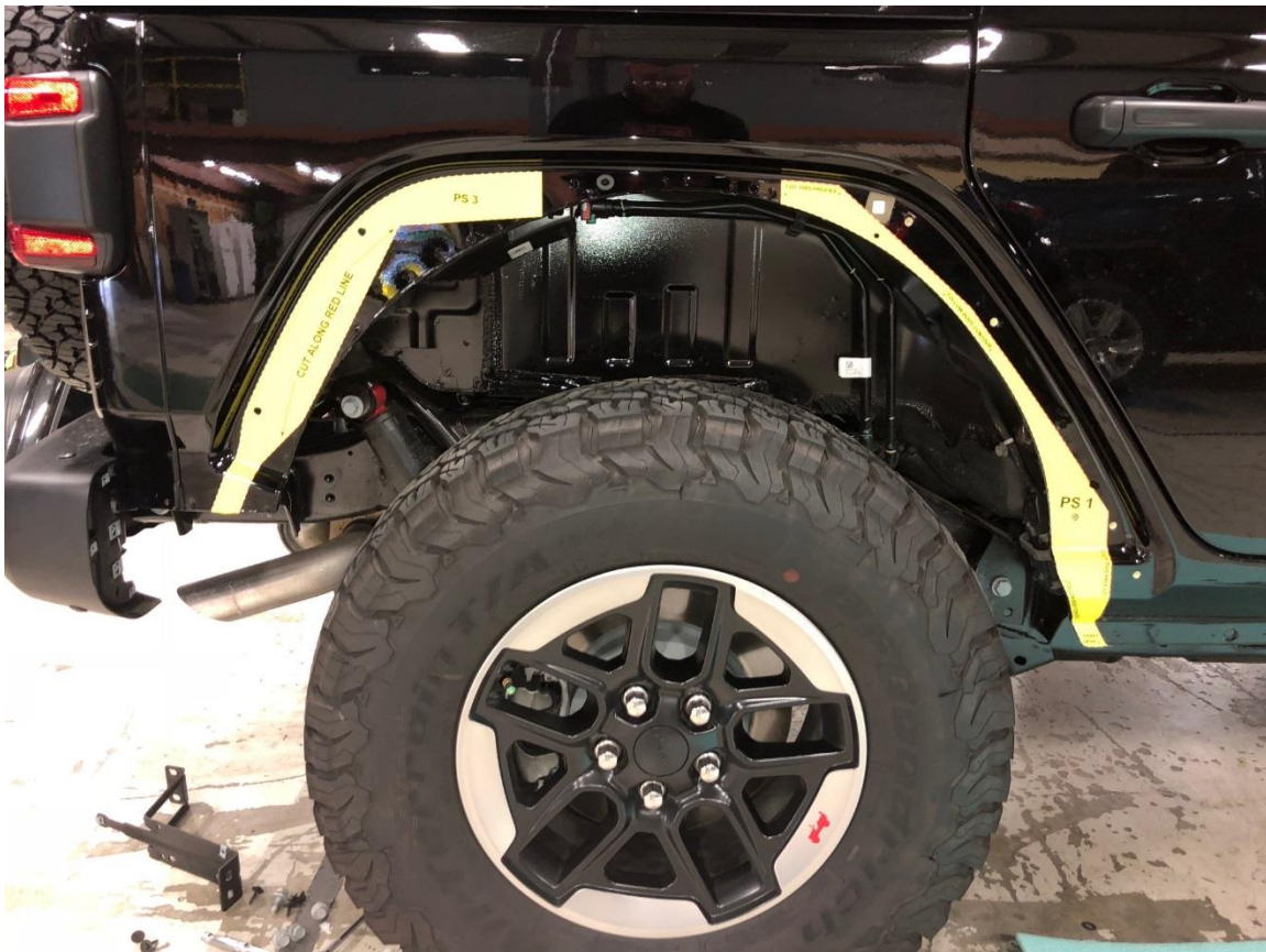
Figure 3. Template placement for PS 1 and PS 3