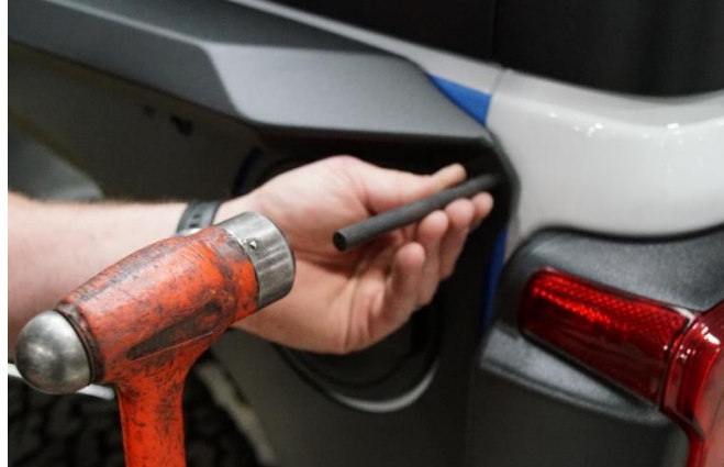
Figure 7. Marking hole locations with transfer punch.