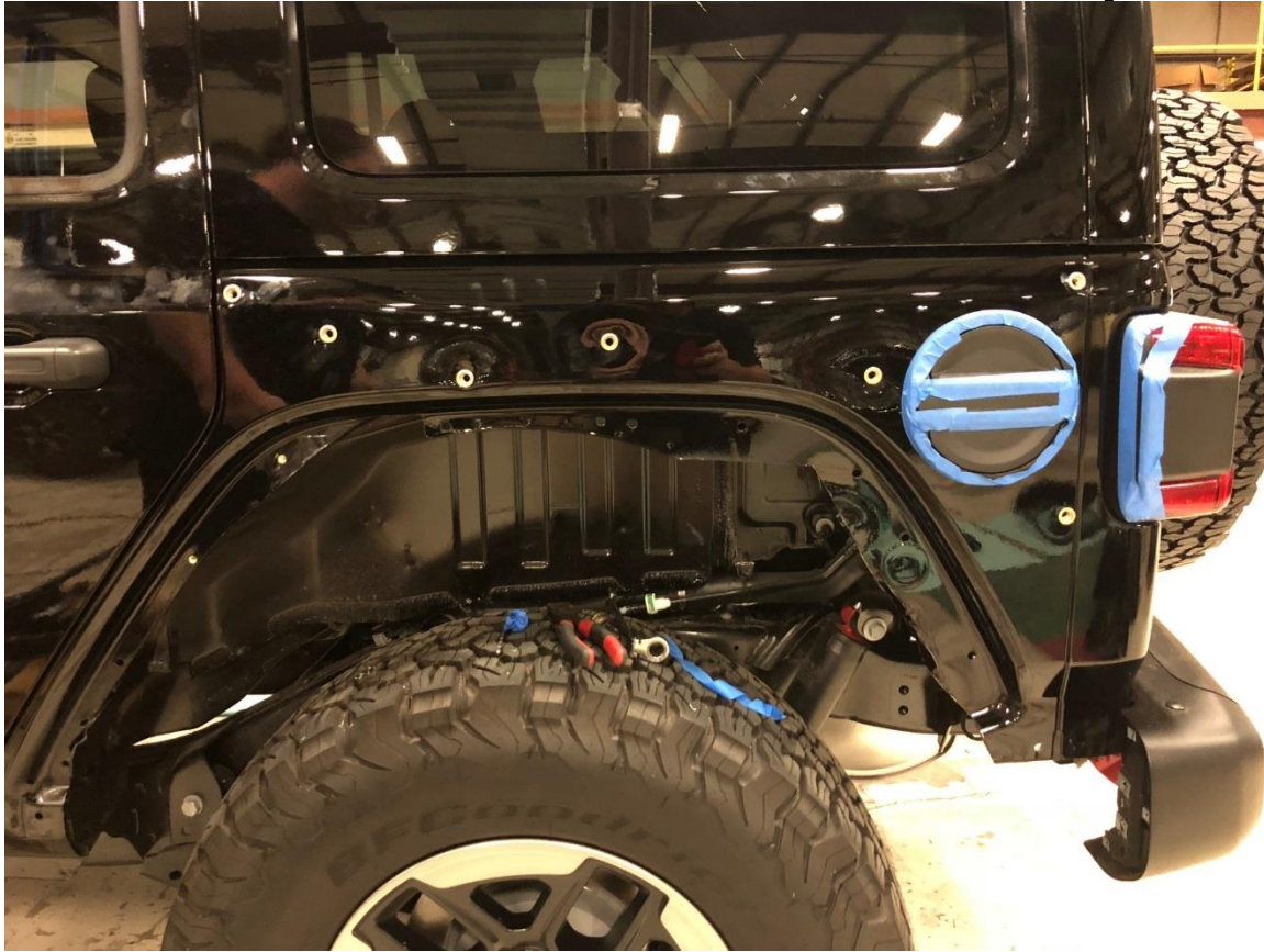
Figure 8. All rivet nuts installed and holes drilled. Red arrows indicate holes to drill out to 17/32"; yellow arrows indicate holes to drill out to 3/8".

6. Once all rivet nuts are installed you can install the fender base. Start by re-installing the middle bolt and the lower, forward bolt. This will hold the fender on vehicle while you install the rest of the hardware.