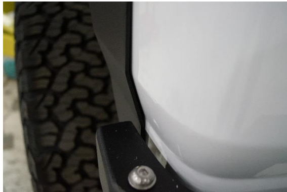
Figure 6a. Initial placement of fender for marking mounting points correctly.