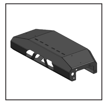
22694 – CENTER ASSEMBLY