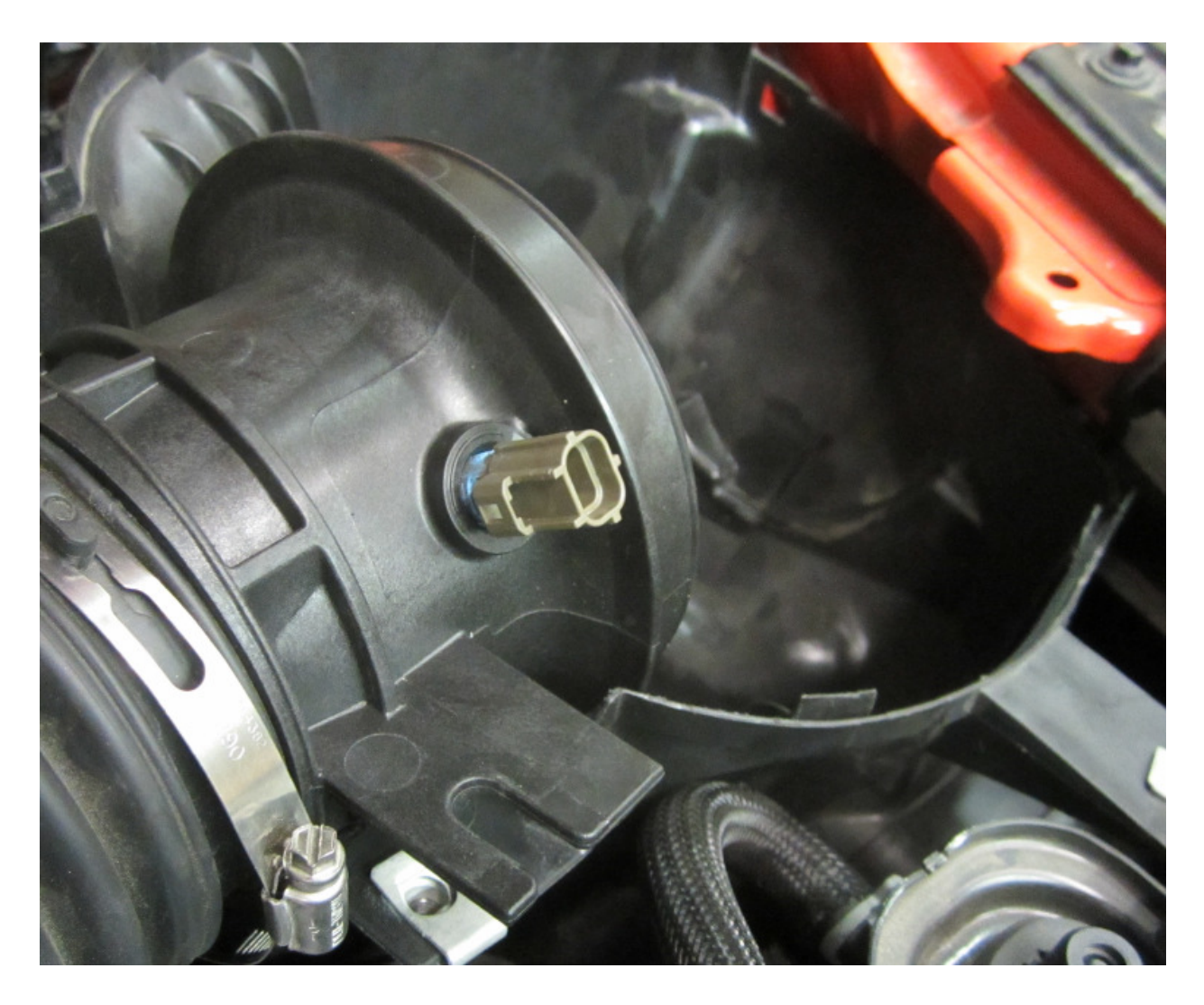
Install IAT sensor into adapter and install adapter into hose. Do not tighten clamp.

NO PART OF THIS DOCUMENT MAY BE REPRODUCED WITHOUT PRIOR AGREEMENT AND WRITTEN PERMISSION OF FORD PERFORMANCE PARTS