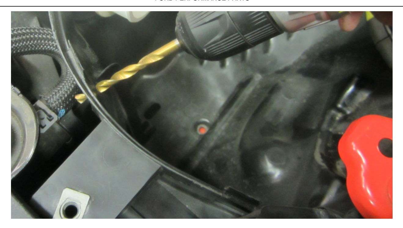
Drill hole for harness retainer.

NO PART OF THIS DOCUMENT MAY BE REPRODUCED WITHOUT PRIOR AGREEMENT AND WRITTEN PERMISSION OF FORD PERFORMANCE PARTS