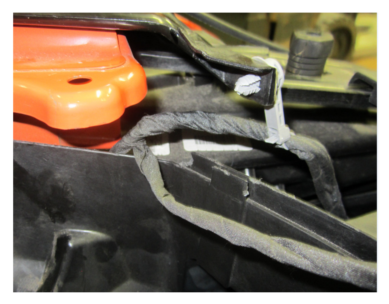
Route IAT sensor harness inside air bucket.

NO PART OF THIS DOCUMENT MAY BE REPRODUCED WITHOUT PRIOR AGREEMENT AND WRITTEN PERMISSION OF FORD PERFORMANCE PARTS