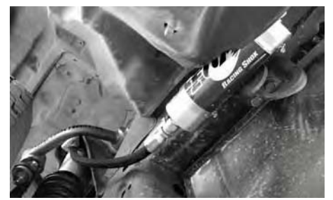
Fig. 4: Passenger side