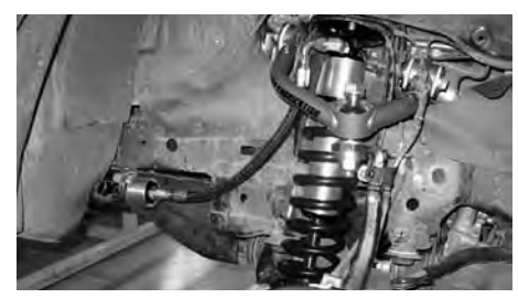
Fig. 2: Driver side