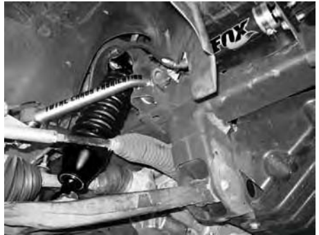
Fig. 4: Passenger side