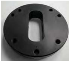
Fig. 3: Correct holes marked with a dot

and towards the front of the vehicle (Fig. 2). Connect the top shock hat to the vehicle using the bolts and washers