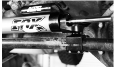
Fig. 4: Stabilizer loosely clamped to tie rod