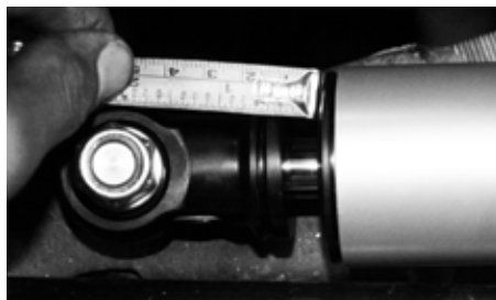
Fig. 2: 1/4" of shaft exposed