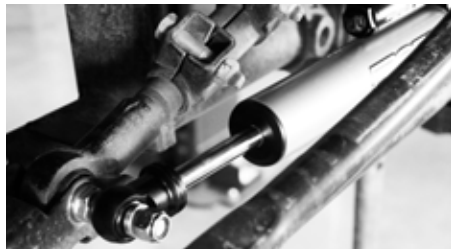
Fig. 3: Eyelet installed on track bar bolt