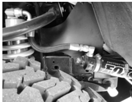
Fig. 2: Passenger side

between vehicle frame and skid plate braces with the supplied longer M10 bolts. Torque to 30 ft*lbs (Fig. 4).