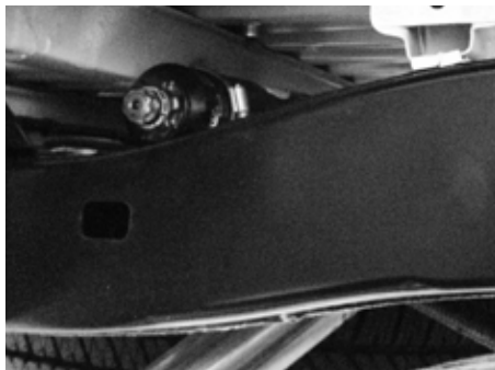
Fig. 3: Passenger side reservoir location