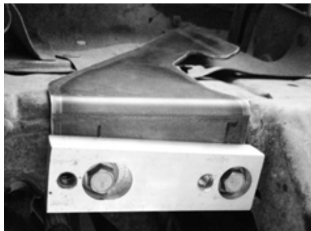
Fig. 3: Driver side sway bar relocation spacer