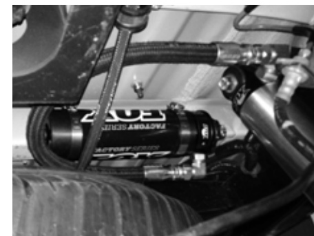
Fig. 3: Driver side hose orientation