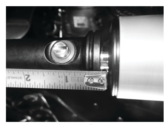
Fig. 1: Eyelet installed with 1/8" of shaft exposed.