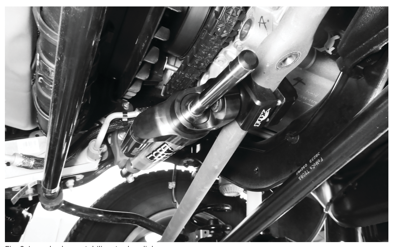
Fig. 2: Loosely clamp stabilizer to drag link.

6. Loosely mount Group A clamp to drag link with Group A fasteners (Fig. 2).