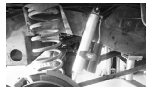
Fig. 5: Passenger side

8. Reinstall wheels, torque to factory specifications.