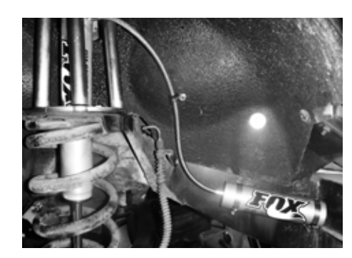
Fig. 4: Driver side remote reservoir mounting

10. Connect shock tower to vehicle reusing factory hardware, torque to factory specifications. For external reservoir models, please refer to shock tower manufacturers recommended mounting and torque specifications.