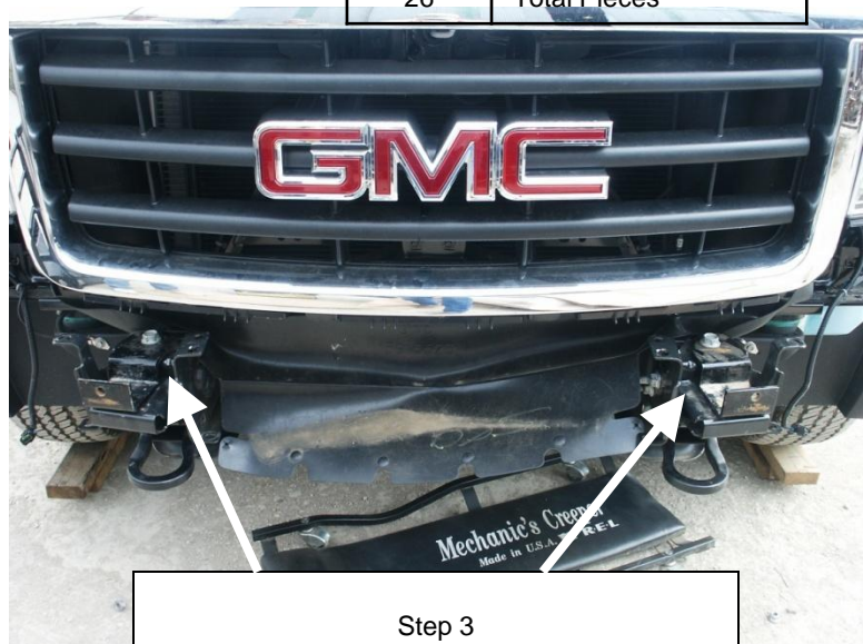
Step 3 Frame support bracket installed

Step 6: Check alignment of front end replacement to truck and tighten all bolts.