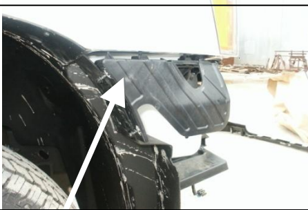
Step 1 Remove plastic shield above chrome bumper