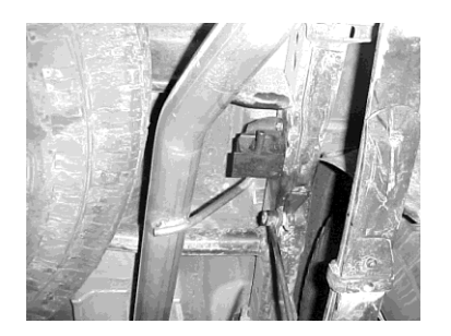
INSTALL OVERAXLE TAILPIPE # C INTO MUFFLER 1 ½"-2". SECURE TO THE MUFFLER U SING CLAMP # E . DO NOT TIGHTEN.

LAY OUT THE GIBSON EXHAUST ON THE FLOOR AND COMPARE PART #'S TO THE DRAWING. TO REMOVE THE STOCK EXHAUST REMOVE IT FROM THE 2 BOLT FLANGES, LOCATED IN FRONT OF YOUR FACTORY MUFFLER. NEXT, CUT IFF YOUR STOCK TAILPIPE BEHIND YOUR MUFFLER. DO NOT DISGARD YOUR FACTORY HARDWARE, YOU WILL RE-USE IT.