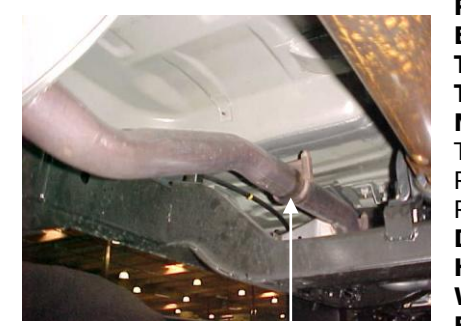
REMOVE FROM HERE

INSTALL THE MUFFLER ONTO THE HEADPIPE 1" TO 2". THE INLET OF THE MUFFLER WILL HAVE THE INSIDE LOUVERS FACING FORWARD. USE CLAMP #E TO SECURE MUFFLER TO THE HEADPIPE. OUTLET SHOULD BE AT THE 7 O'CLOCK POSISTION. DO NOT TIGHTEN.