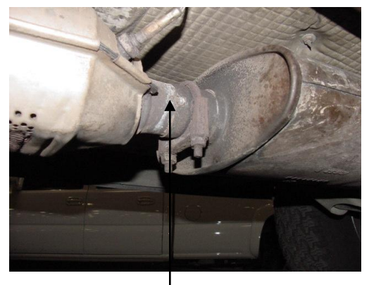
CUT 1" OFF BEHIND THE CONVERTER SO THE NOTCH IN THE MUFFLER WILL SLIP ON COMPLETELY.

LAY OUT THE EXHAUST AND COMPARE PART NUMBERS WITH THE DRAWING.