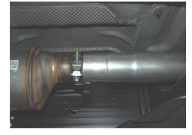
4. Install muffler #B with inlet towards Y-pipe. Use jack stands to support the muffler. Use clamp #F to secure the muffler to headpipe. Do not tighten.

6. Now install driver side tailpipe #D. The spare tire may need to be loosened and pushed to the driver side to allow for clearance. Use bolt kit #H to attach both tailpipes together.