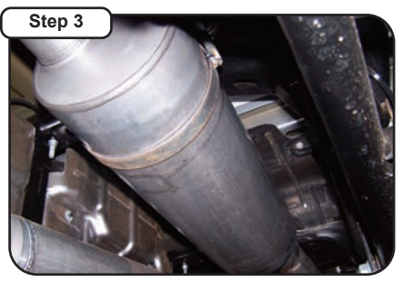
Install muffler #B onto head pipe #A 1 1/2"-2". Use a jack stand to support the muffler. Use clamp #F to secure the muffler to the head pipe. Do not tighten.