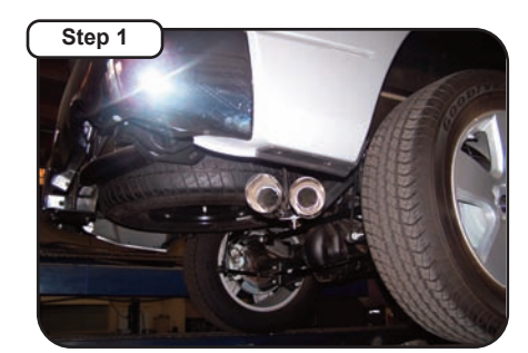
Attach Stainless Steel tips. When you have everything in place, firmly tighten all bolts and clamp down securely. Use stainless steel cleaner and a Scotch Brite pad weekly to prevent tip from discoloration. Inspect all fasteners after 25-50 miles of operation and re-tighten if necessary.