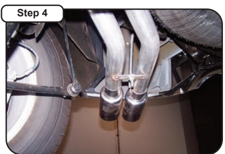
Install the passenger side overaxle tailpipe # C to the muffler 1 1/2"-2". Use clamp #G to secure tailpipe to muffler. Do not tighten. Insert welded hangers into rubber grommets.