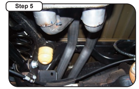
Install drivers side overaxle tailpipe #D into the muffler. Use clamp #G to secure. Do not tighten. Insert welded hangers into rubber grommets.