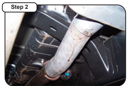
Install head pipe # A onto your existing stock front pipe and attach with clamp #F Do not tighten . Insert welded hanger into rubber grommet.

To remove the stock exhaust, remove your factory exit pipes. Next, remove your tailpipes by unbolting them from the back of your stock muffler. Remove your factory muffler from the clamp in front of it. Use WD-40 to aid in removal of factory grommet that will be re-used.