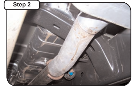
Install head pipe # A onto your existing stock front pipe and attach with clamp #G. Do not tighten . Insert welded hanger into rubber grommet.