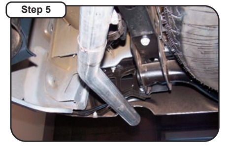
Next, install the exit pipes #E. Use Clamp #H to secure to the tail pipes. Adjust all pipes for proper clearance and fitment.