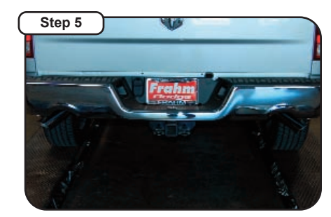
Attach Stainless Steel Tips. When you have everything in place, firmly tighten all bolts and clamps down securely. Use stainless steel cleaner and a Scotch Brite pad weekly to prevent tip from discoloration. Inspect all fasteners after 25-50 miles of operation and re-tighten if necessary.