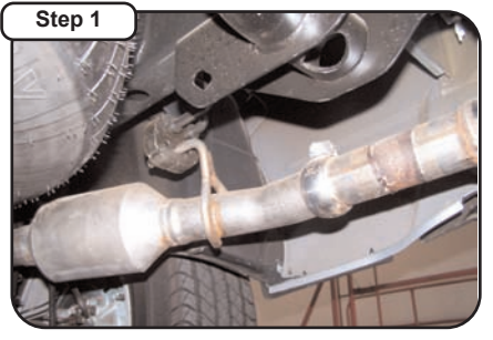
To remove the stock exhaust, remove your factory exit pipes. Next, remove your tailpipes by unbolting them from the back of your stock muffler. Remove your factory muffler from the clamp in front of it. Use WD-40 to aid in removal of factory grommet that will be re-used.

When installing this exhaust system allow use of proper safety precautions. Use jack stands when under the truck, set parking brake, block tires and use safety glasses and gloves. Disconnect the negative battery cable before removal of OEM exhaust. This will allow the computer to reset and recognize the new exhaust. Lay out the exhaust on the floor so it looks like the drawing and compare parts with manual. DO NOT WORK WITH HOT PIPES!