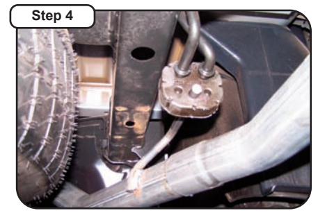
Install the passenger side overaxle tailpipe # C to the muffler 1 1/2"-2". Use clamp #H to secure tailpipe to muffler. Do not tighten. Insert welded hangers into rubber grommets.