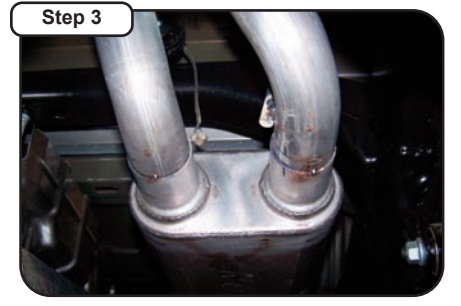
Install muffler #B onto head pipe #A 1 1/2"-2". Use a jack stand to support the muffler. Use clamp #G to secure the muffler to the head pipe. Do not tighten.