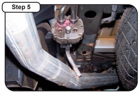
Install drivers side overaxle tailpipe #D into the muffler. Use clamp #H to secure. Do not tighten. Insert welded hangers into rubber grommets.