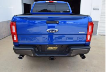
7. INSTALL DRIVER SIDE TAILPIPE HANGER BY SLIDING THE SIDE WITH THE HOLE BETWEEN THE TWO TABS WITH HOLES THAT PROTRUDE FROM THE FRAME JUST ABOVE THE DRIVER SIDE EXIT PIPE LOCATION. NEXT, INSTALL EXIT PIPES USING BAND CLAMPS.

8. INSTALL THE TIPS BY SLIDING THEM OVER EACH EXIT PIPE AND THEN ADJUSTING THEM TO YOUR DESIRED LENGTH AND ROTATION. EXIT PIPES CAN BE ROTATED FOR DESIRE TIP CLEARANCE FROM BUMPER. TIGHTEN ALL CLAMPS STARTING FROM THE FRONT OF THE SYSTEM TO THE BACK.