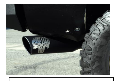
7. Be sure to check all clearance after each section has been tightened to be sure there is proper clearance. It may take 4-500 miles for your vehicle to fully adjust to the changes in exhaust flow.

"MAKE SURE YOU HAVE A 1" CLEARANCE ON ALL PIPES FROM ALL RUBBER BRAKE LINES, SHOCK BOOTS, TIRES, ETC..." TORQUE ALL CLAMPS TO APPROX. 100 TO 150 FT LBS.