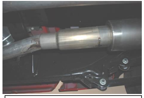
3. Install the muffler assembly Item # B onto the Head pipe Item # A. Slide the rear hangers into the factory rubber grommets.