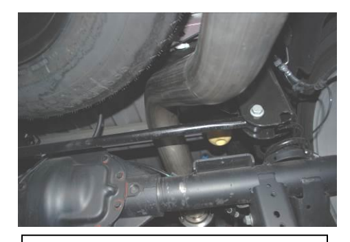
6. With proper clearance from spare tire install the exhaust tip onto the tailpipe. The system was designed to have the tip 1" below the quarter panel of the vehicle. With the tip in your desired position begin to tighten down all clamp connections from the