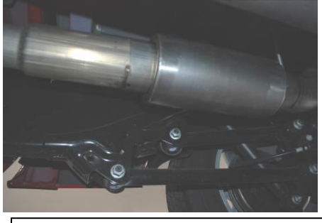
4. Use Clamp Item # E to secure the connection. Do not tighten keep loose for kit adjustment and alignment.