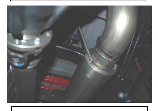
5. Install the Over axle pipe Item # C into the muffler outlet. With everything loose you may need to adjust the system for proper clearance of shocks, brake lines, ect.