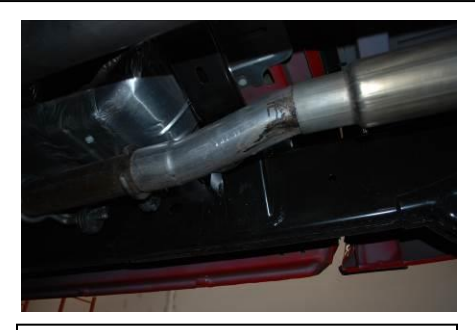
2. Install Head Pipe Item # A into the factory head pipe. Use the clamp Item # E at this connection. Loosely tighten down the clamp.

1. Disconnect the negative battery cable before removal of the OEM Exhaust. This will allow the computer to reset and recognize the new exhaust. Lay out the exhaust on the floor so it looks like the drawing and compare parts with manual. Remove the factory exhaust by cutting behind the factory muffler. Once the tail pipe has been removed un-bolt the muffler and head pipe at the clamp located in front of the factory muffler. Use wd-40 or another type of penetrating oil to remove the rubber grommets. Do not damage these they will be re used.