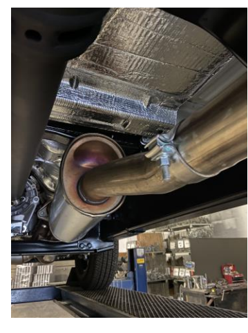
2. TO REMOVE YOUR STOCK EXHAUST, REMOVE IT FROM THE CLAMP LOCATED JUST THE RESONATOR. REMOVE HANGERS FROM RUBBER GROMMETS, USE WD-40 TO AID IN REMOVAL, LEAVE GROMMETS IN PLACE.

1. Disconnect the negative battery cable before removal of OEM exhaust. This will allow the computer to reset and recognize the new exhaust. Lay out the exhaust on the floor so it looks like the drawing and compare parts with manual.