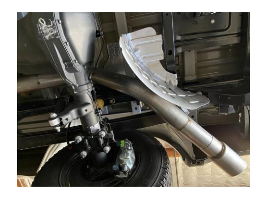
5 . Finally, over axle pipe #C can be installed using the Band Clamp #E. Once the over axle pipe is in you may install the Tip to your desired wants. (Tighten all clamps working from front to back.)