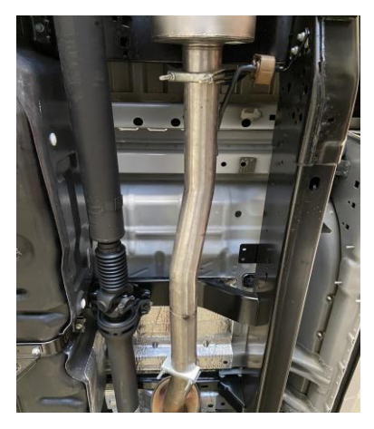
3. INSTALL HEADPIPE #A ONTO STOCK PIPE BEHIND RESONATOR. INSERT WELDED HANGER INTO RUBBER GROMMET. USE CLAMP #D PROVIDED TO SECURE. DO NOT TIGHTEN.