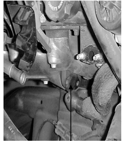
EGR TUBE FITTING

8) REMOVE THE SIX BOLTS ATTACHING THE MANIFOLD TO THE HEAD. REMOVE THE MANIFOLD. CLEAN THE SURFACE OF THE HEAD. REMOVE ANY CARBON DEPOSITS THAT MAY BE ON THE HEAD. PREPARE THE SUPPLIED HEADER BOLTS WITH ANTI-SEIZE TO THE THREADS.