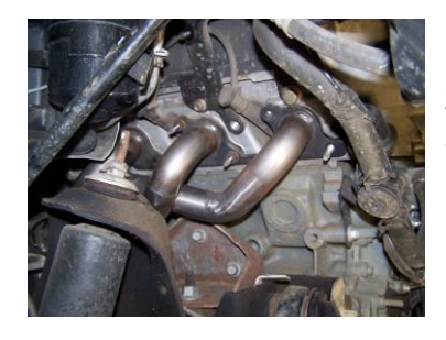
Now install Gibson Header and supplied gasket. Torgquing header to 30 to 35 fts torque.