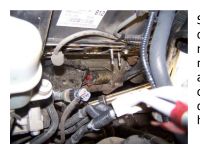
Starting on driver side remove dipstick using 5/16 socket and ratchet. Then remove stock manifold using 13mm socket and ratchet. Make sure to clean head surface of all debris before installation of header.

Remove manifold and stock gasket. Make sure to clean head surface of all debris before installation of header.