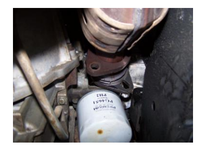
Re-Install Y-pipe assembly torque all fasteners to 30 to 35 fts torque. Then connect or sensor back in. Then start vehicle and check for leaks. Then after vehicle warms up let it cool down and re-torque all fasteners!

Start on passanger side its highly recommended to remove the inner-fender well to access the manifold. Loosen and set aside the transmission dipstick.