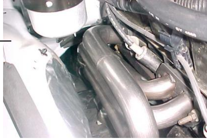
Passenger Side Gibson Header