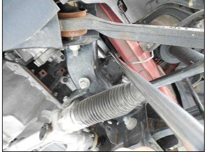
Figure 2 – Access to top bolts driver's side

NOTE: It is normal for your new Blackheart exhaust system to emit smoke for the first few minutes of operation.