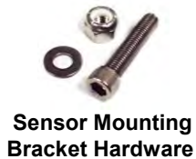
Sensor Mounting Bracket Hardware