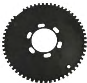
Crank Trigger Wheel

3.0 PARTS IDENTIFICATION: Photographs shown are of a Small Block Chevrolet Kit. Your kit may vary.