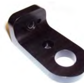
Sensor Mounting Bracket