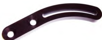
Block Bracket (SB shown)