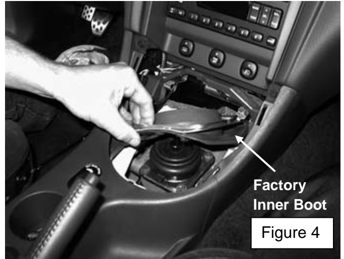
Factory Inner Boot Figure 4

5. Using a 13mm socket, remove four (4) hex head bolts that fasten stock shifter assembly to transmission. Discard bolts, new ones are supplied. Lift shifter assembly straight up and off. NOTE: You may have some difficulty in removing stock shifter from transmission due to adhesive sealant applied at factory.