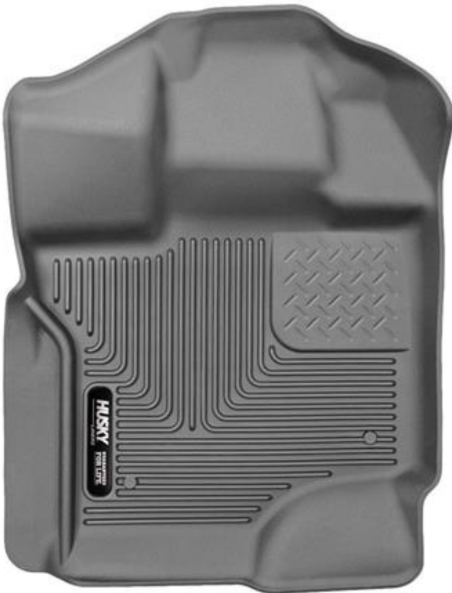
LEFT OR DRIVER

Your liners are made from an engineering resin that is lightweight and extremely tough and durable. The easiest way to clean your liners is with a damp cloth or sponge and soap and water. Windex®, 409® and ArmorAll® type cleaners work as well.