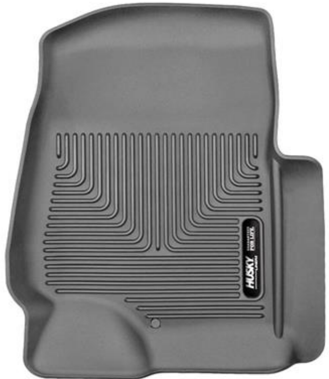
RIGHT OR PASSENGER

TO INSTALL DRIVER'S SIDE LINER SIMPLY POSITION LINER OVER EXISTING RETAINER AND PRESS DOWN TO SEAT LINER OVER THE RETAINER. INCLUDED IN YOUR PACKAGING IS AN ADDITIONAL RETAINING POST FOR THE PASSENGER SIDE. SEE INSTALLATION DETAILS ON THE BACK OF THIS PAGE.