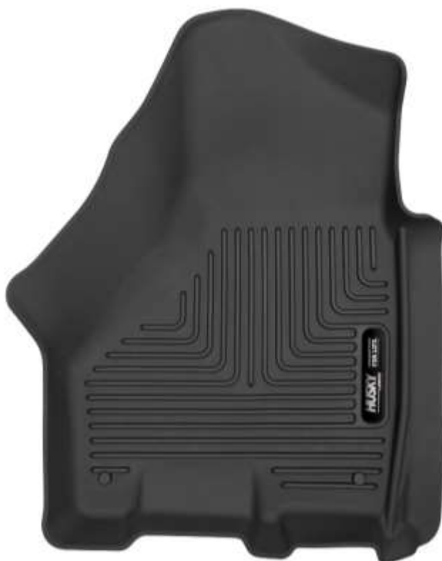
RIGHT OR PASSENGER

TO INSTALL YOUR NEW LINERS, POSITION THEM IN THE FLOOR PANS AS SHOWN ABOVE. THE LINERS ATTACH TO THE FACTORY FLOOR MAT RETAINING POSTS. ALIGN THE LINERS OVER THE POSTS AND PRESS DOWN IN THE AREA ABOVE THE POSTS TO SNAP THEM INTO PLACE.