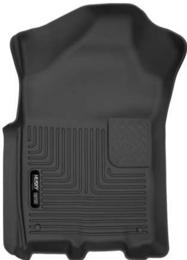
LEFT OR DRIVER

Your liners are made from an engineering resin that is lightweight and extremely tough and durable. The easiest way to clean your liners is with a damp cloth or sponge and soap and water. Windex®, 409® and ArmorAll® type cleaners work as well.