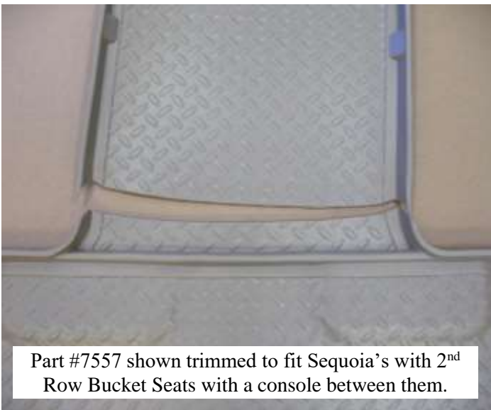
Part #7557 shown trimmed to fit Sequoia's with 2 nd Row Bucket Seats with a console between them.

Models With 2 nd Row Bench Seating: Trimming is needed to allow the correct fit in vehicles with 2 nd Row Bench seats. To trim, remove the whole “tongue” portion of liner as show above (areas “1” and 2”). Use edge of the raised moat as your trim guide (see photo below), leaving the moat attached to the part. A utility knife or heavy shears work well for trimming.