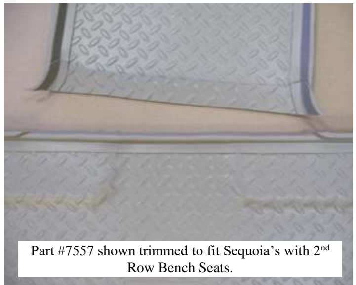
Part #7557 shown trimmed to fit Sequoia's with 2 nd Row Bench Seats.