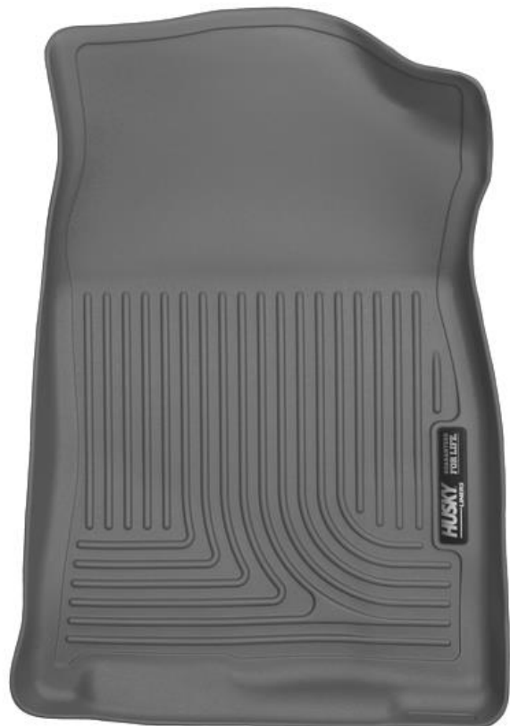
RIGHT OR PASSENEGER'S SIDE

TO EASE INSTALLATION OF YOUR FRONT FLOOR LINERS, FIRST SLIDE BOTH FRONT ROW SEATS BACK TO EXPOSE THE FRONT FLOOR PANS. INSTALL LINERS TAKING CARE TO ATTACH THE DRIVER'S SIDE LINER TO THE FACTORY TWIST-LOCK RETAINERS. ONCE YOU HAVE INSTALLED THE FRONT LINERS, REPOSITION THE FRONT SEATS AS DESIRED.