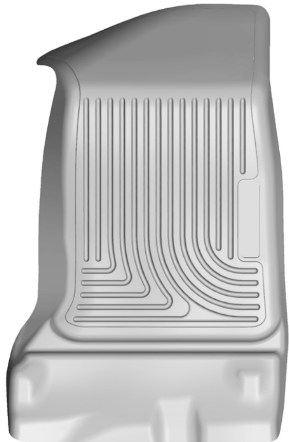
RIGHT OR PASSENEGER'S SIDE

TO EASE INSTALLATION OF YOUR CAMARO FRONT FLOOR LINERS, FIRST SLIDE BOTH FRONT ROW SEATS BACK TO EXPOSE THE FRONT FLOOR PANS. INSTALL LINERS TAKING CARE TO ATTACH THE DRIVER'S SIDE LINER TO THE FACTORY POST STYLE MAT RETAINERS. ONCE YOU HAVE INSTALLED THE FRONT LINERS, REPOSITION THE FRONT SEATS AS DESIRED.