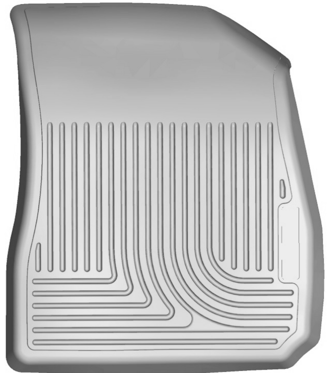
RIGHT OR PASSENEGER'S SIDE

TO EASE INSTALLATION OF YOUR MALIBU FRONT FLOOR LINERS, FIRST SLIDE BOTH FRONT ROW SEATS BACK TO EXPOSE THE FRONT FLOOR PANS. INSTALL LINERS TAKING CARE TO ATTACH THE DRIVER'S SIDE LINER TO THE FACTORY POST STYLE MAT RETAINERS. ONCE YOU HAVE INSTALLED THE FRONT LINERS, REPOSITION THE FRONT SEATS AS DESIRED.