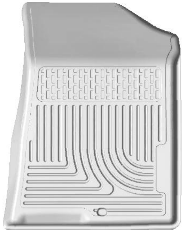
RIGHT OR PASSENEGER'S SIDE

TO EASE INSTALLATION OF YOUR SONATA FRONT FLOOR LINERS, FIRST SLIDE BOTH FRONT ROW SEATS ALL THE WAY BACK TO EXPOSE THE FRONT FLOOR PANS. ONCE YOU HAVE INSTALLED THE FRONT LINERS, REPOSITION THE FRONT SEATS AS DESIRED. NOTE THAT DRIVER'S SIDE LINER ATTACHES TO THE FACTORY MAT RETAINING HOOKS LOCATED IN THE DRIVER'S SIDE FLOOR PAN.