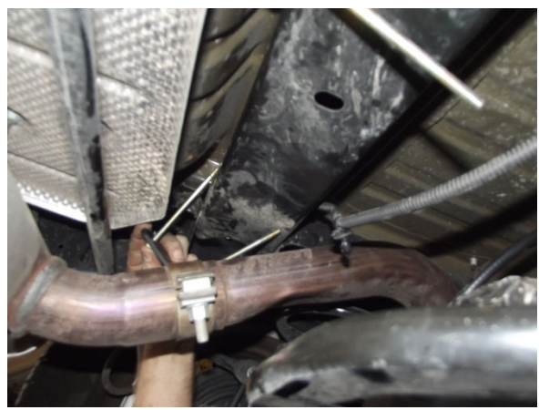
Photo 3 -Slide the rear mount plate/bolt assemblies over the beam. Work from the driver's side and slide the assemblies towards the passenger's side