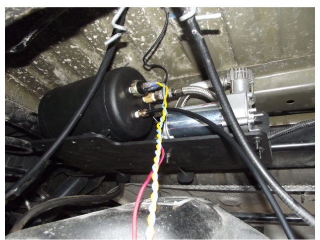
Photo 8 – Air tank positioned on mounting bracket. Note how the braided steel leader hose is looped between the compressor body and the mounting bracket.