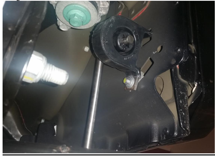
STEP 4. Slip side exit exhaust pipe onto extension (or muffler if Super Cab) using 3" band clamps and slide into both hangers.

STEP 5. Adjust system to desired tip location and tighten all band clamps.