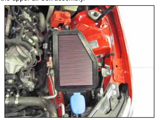
7. Replace the air filter with the provided K&N® performance air filter and reinstall the upper air box assembly. Secure the upper air box assembly with the five factory retaining clips.