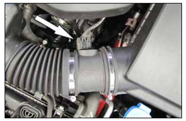
3. Disconnect the mass air sensor electrical connection.