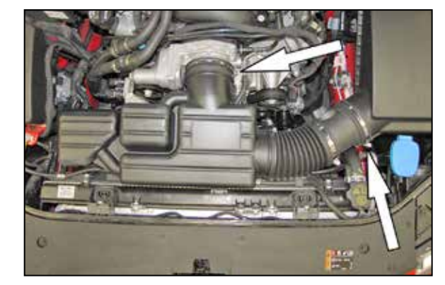
5. Loosen the hose clamps securing the intake plenum to the throttle body and to the mass air sensor then remove the plenum from the vehicle. NOTE: K&N Engineering, Inc., recommends that customers do not discard factory air intake.