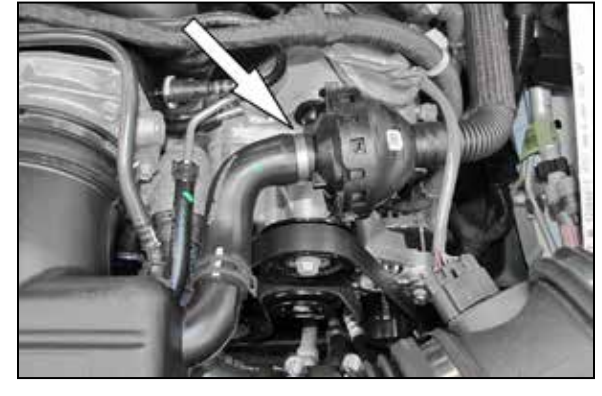
3A. On vehicles equipped with a sound drum, disconnect the sound tube from the drum and cap off the drum with the provided caplug.