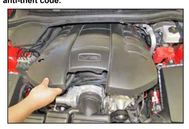
2. Remove the oil fill cap and then remove the decorative engine cover. Reinstall the oil cap to prevent debris from entering the engine.

NOTE: Disconnecting the negative battery cable erases pre-programmed electronic memories. Write down all memory settings before disconnecting the negative battery cable. Some radios will require an anti-theft code to be entered after the battery is reconnected. The anti-theft code is typically supplied with your owner's manual. In the event your vehicles anti-theft code cannot be recovered, contact an authorized dealership to obtain your vehicles anti-theft code.