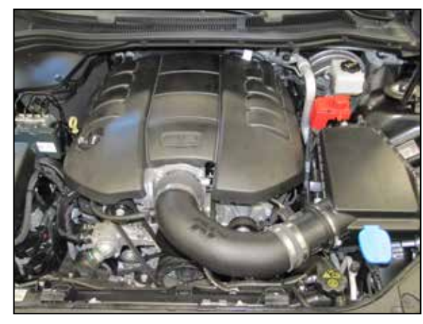
15. Reconnect the vehicle's negative battery cable. Double check to make sure everything is tight and properly positioned before starting the vehicle.

16. It will be necessary for all K&N® high flow intake systems to be checked periodically for realignment, clearance and tightening of all connections. Failure to follow the above instructions or proper maintenance may void warranty.