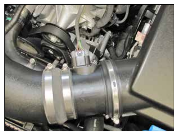
13. Reconnect the mass air sensor electrical connection.