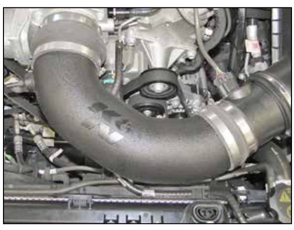
11. Install the K&N® intake tube into the coupling hose at the mass air sensor and then into the hose at the throttle body. Adjust the tube for proper fit and then secure with the provided hose clamps.

NOTE: Plastic NPT fittings are easy to cross thread. Install the vent fitting "hand" tight, then turn it two complete turns with a wrench.