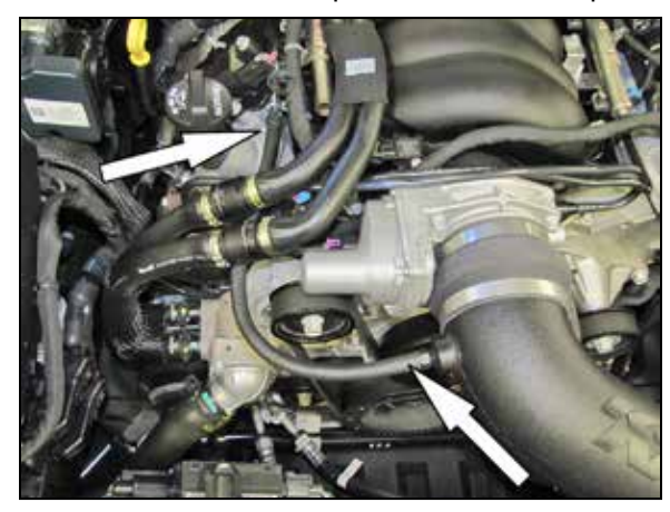
12. Connect the provided crank case vent hose to the fitting installed into the K&N® intake tube and then connect the open end to the port on the valve