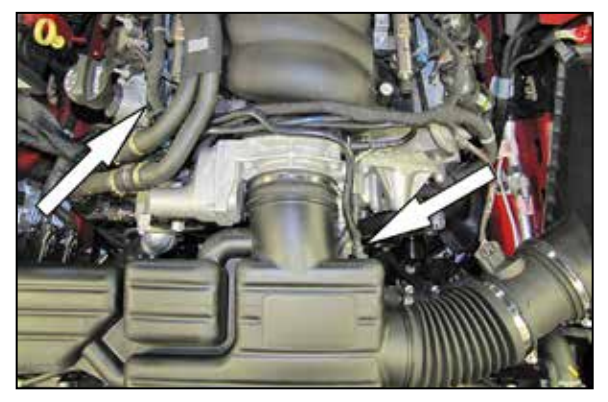
4. Disconnect the crank case vent hose from the intake plenum and valve cover and then remove the hose from the vehicle.