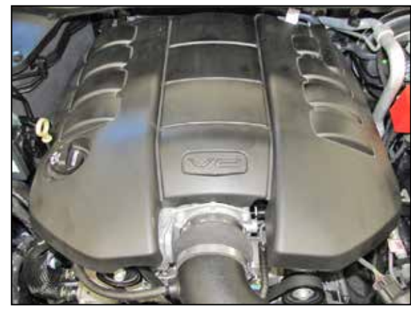
14. Reinstall the decorative engine cover.