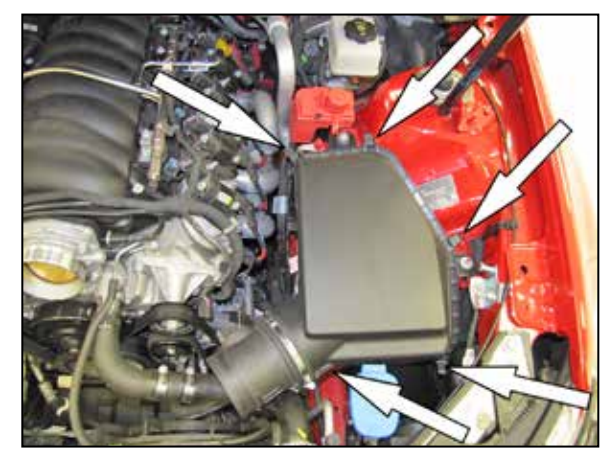
6. Release the five retaining clips and then remove the upper air box assembly.