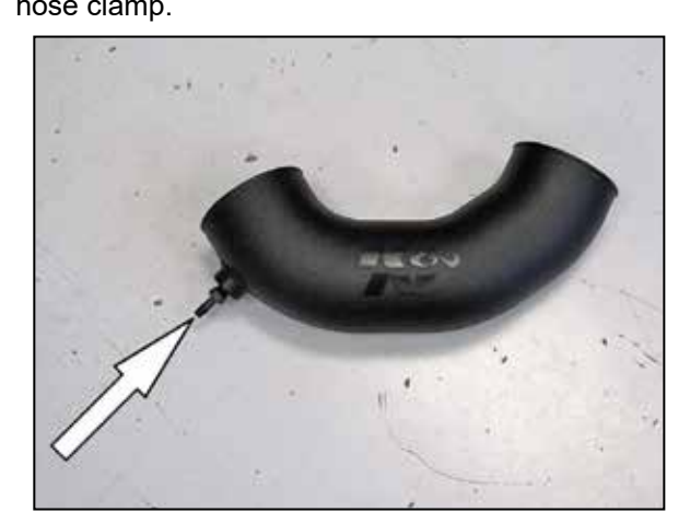
10. Install the provided vent fitting into the K&N® intake tube as shown.

NOTE: Plastic NPT fittings are easy to cross thread. Install the vent fitting "hand" tight, then turn it two complete turns with a wrench.