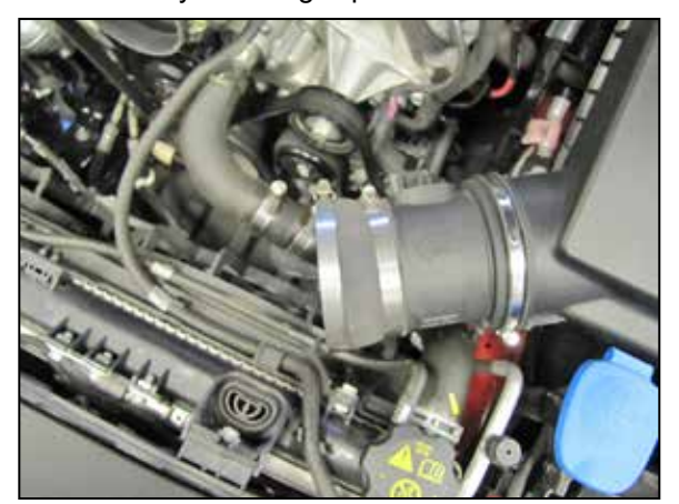
8. Install the provided coupling hose (08618) onto the mass air sensor and secure with the provided hose clamp.