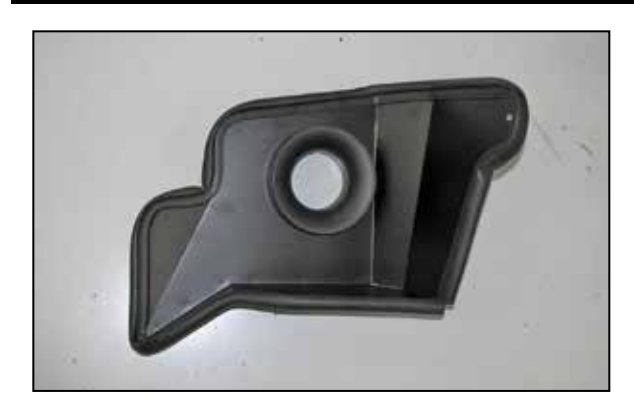
7. Install the provided edge trim onto the heat shield as shown.

NOTE: Some trimming of the edge trim will be necessary.