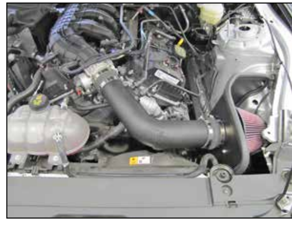
16. Reconnect the vehicle's negative battery cable. Double check to make sure everything is tight and properly positioned before starting the vehicle.