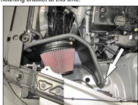
10. Flex the heat shield back and install the K&N® air filter onto the adapter then secure the filter with the hose clamp. Secure the upper heat shield mounting bracket with the hardware provided. NOTE: Drycharger® air filter wrap; part # 22-8049DK is available to purchase separately. To learn more about Drycharger® filter wraps or look up color availability please visit http://www.knfilters.com®.