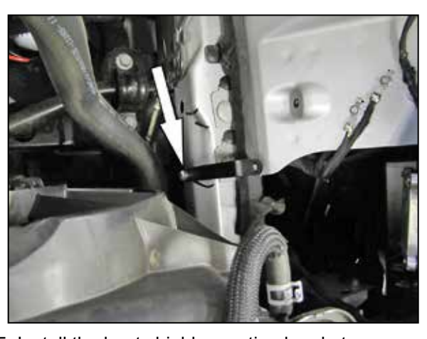
5. Install the heat shield mounting bracket (064325) onto the inner frame rail with the provided hardware as shown.

NOTE: K&N Engineering, Inc., recommends that customers do not discard factory air intake.