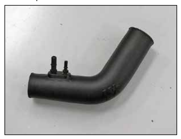
13. Install Quick disconnect fittings into the K&N® intake tube as shown.

NOTE: Plastic NPT fittings are easy to cross thread. Install the vent fitting "hand" tight, then turn it two complete turns with a wrench.