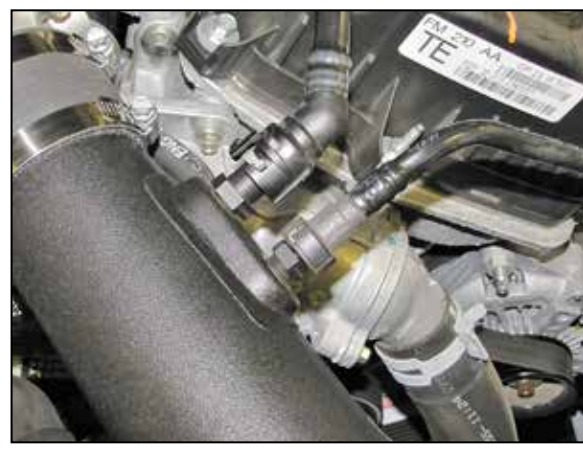
15. Connect the crank case vent and EVAP vent lines to the fittings installed into the K&N® intake tube.