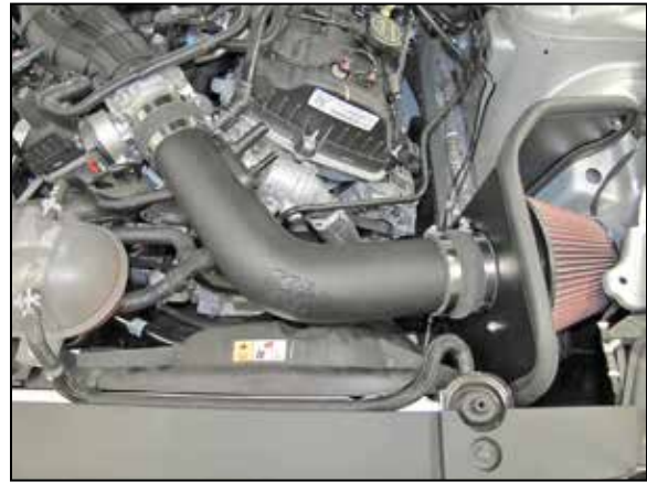
14. Install the intake tube fully into the hump coupler and then into the straight coupler at the throttle body, adjust the tube for best fit and then secure with the provide hose clamps.

NOTE: Plastic NPT fittings are easy to cross thread. Install the vent fitting "hand" tight, then turn it two complete turns with a wrench.