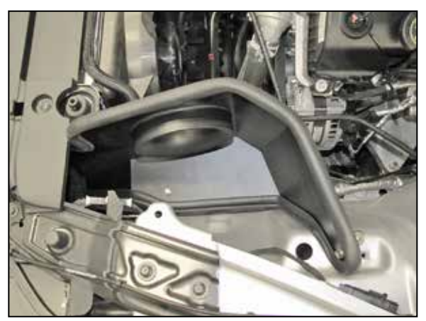
9. Install the heat shield onto the lower mounting bracket and then secure it only to the lower mounting bracket at this time.

NOTE: The spacer should be placed between the heat shield and bracket.