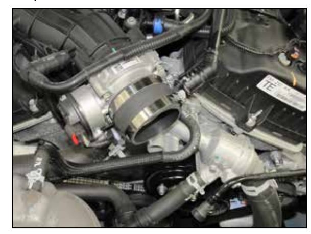
12. Install the provided straight coupler (08711) onto the throttle body and secure with the provided hose clamp.