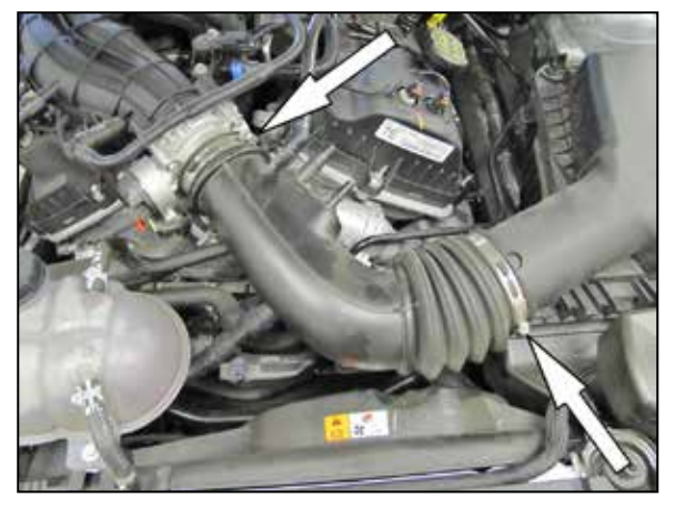
3. Loosen the hose clamps and then remove the factory intake tube.