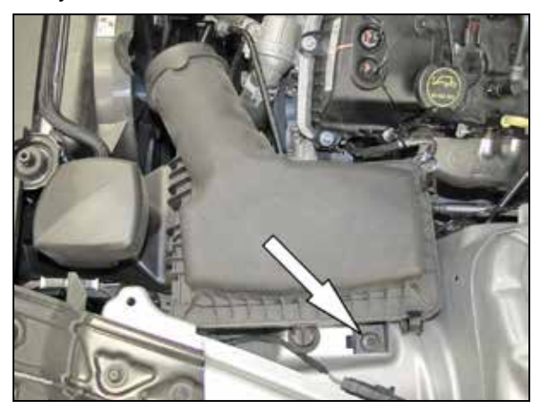
4. Remove the bolt securing the factory air filter housing and then remove the complete air filter housing from the vehicle.

NOTE: K&N Engineering, Inc., recommends that customers do not discard factory air intake.