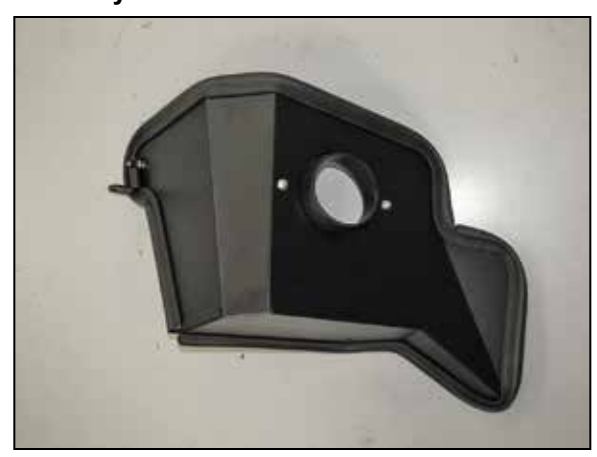
8. Install the provided mounting bracket (064326) and spacer onto the heat shield using the provided hardware.

NOTE: Some trimming of the edge trim will be necessary.