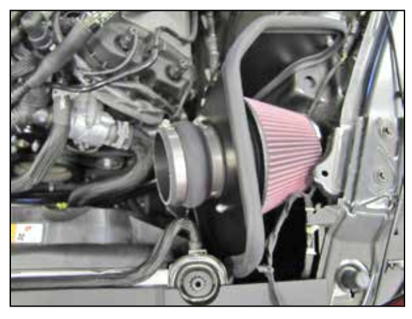
11. Install the provided hump coupler (08699) onto the filter adapter and secure with the provided hose clamp.