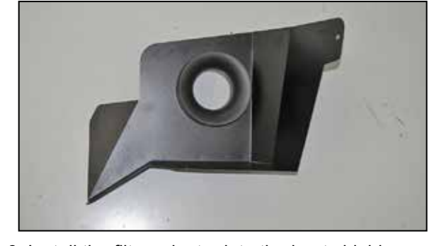
6. Install the filter adapter into the heat shield as shown using the provided hardware.