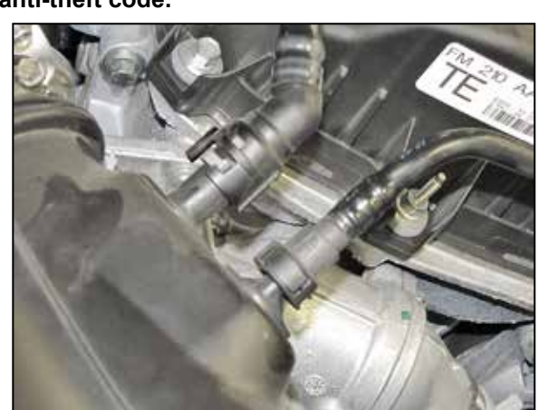
2. Disconnect the crank case vent line and EVAP vent lines from the Intake tube.

NOTE: Disconnecting the negative battery cable erases pre-programmed electronic memories. Write down all memory settings before disconnecting the negative battery cable. Some radios will require an anti-theft code to be entered after the battery is reconnected. The anti-theft code is typically supplied with your owner's manual. In the event your vehicles anti-theft code cannot be recovered, contact an authorized dealership to obtain your vehicles anti-theft code.