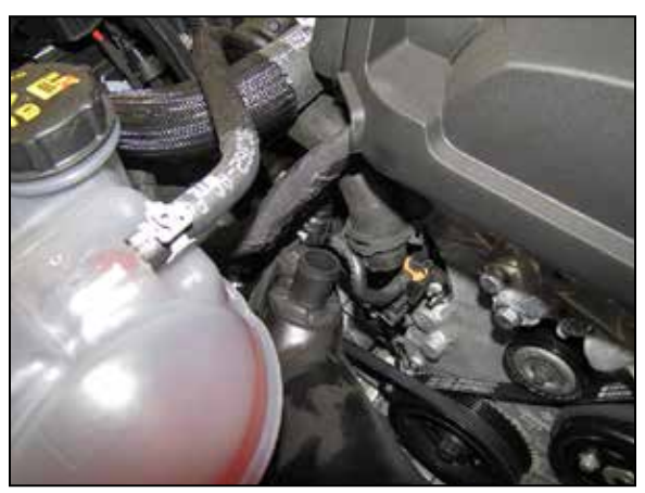
4. Disconnect the BOV hose and crank case vent line from the factory intake tube and then remove the tube from the vehicle.

NOTE: K&N Engineering, Inc., recommends that customers do not discard factory air intake.