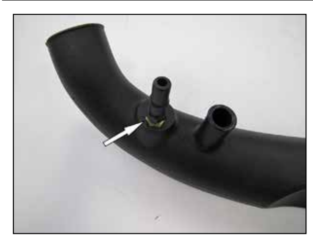
7. Install the provided quick disconnect fitting into the K&N® intake tube as shown.

NOTE: Plastic NPT fittings are easy to cross thread. Install the vent fitting "hand" tight, then turn it two complete turns with a wrench.