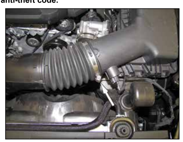
2. Loosen the hose clamp that secures the factory intake tube to the air filter housing.

NOTE: Disconnecting the negative battery cable erases pre-programmed electronic memories. Write down all memory settings before disconnecting the negative battery cable. Some radios will require an anti-theft code to be entered after the battery is reconnected. The anti-theft code is typically supplied with your owner's manual. In the event your vehicles anti-theft code cannot be recovered, contact an authorized dealership to obtain your vehicles anti-theft code.