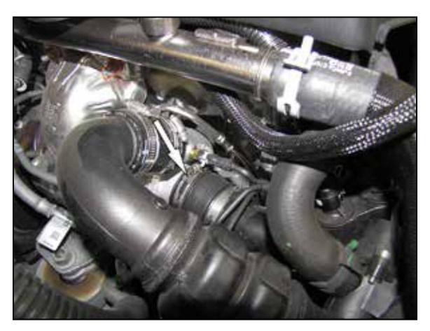
3. Loosen the hose clamp that secures the factory intake tube to the turbo inlet.