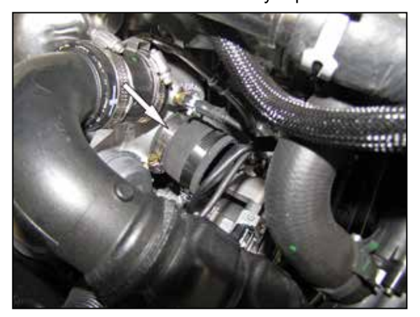
6. Install the provided coupling hose (08638) onto the turbo inlet and secure with the provided hose clamp.