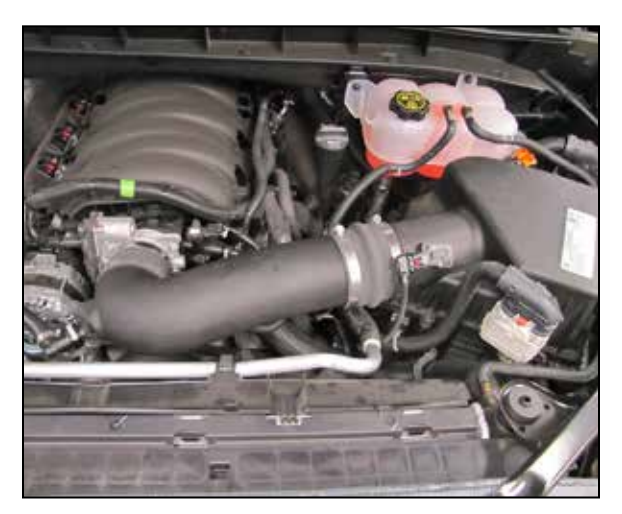
10. Reconnect the mass air sensor electrical connection.