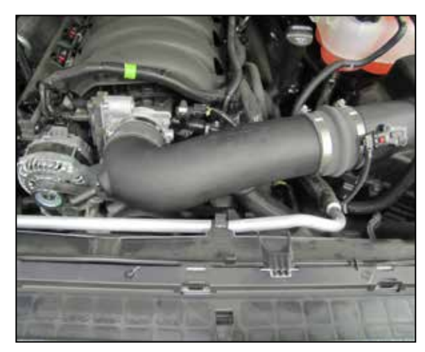
7. Install the K&N<sup>®</sup> intake tube into the coupler at the filter housing and then into the coupler at the throttle body, adjust the tube for best fit and then secure with the provided hose clamps.