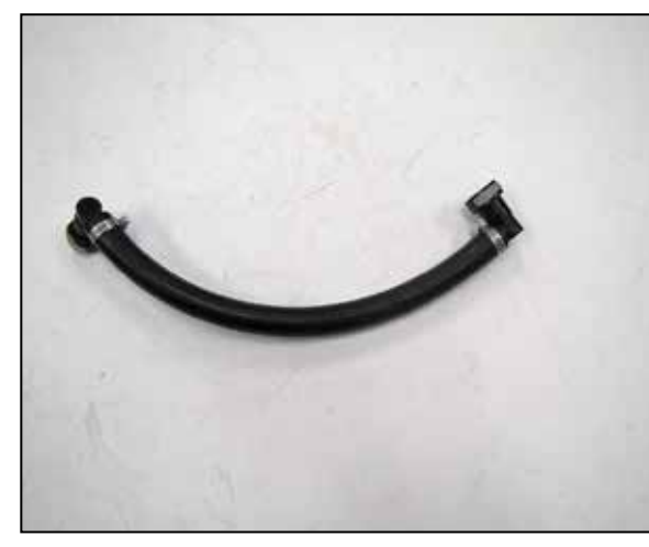
8. Assemble the crank case vent assembly as shown using the provided components.