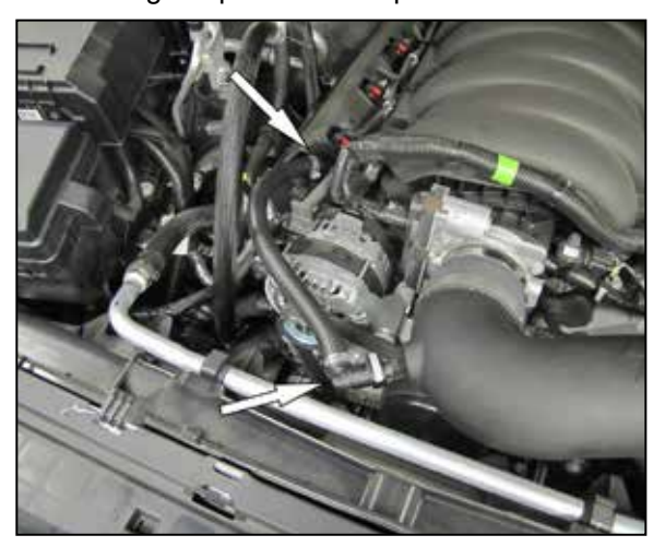
9. Install the crank case vent assembly onto the valve cover port and the fitting installed into the K\&N^{\mbox{\tiny $\$$}} intake tube as shown.