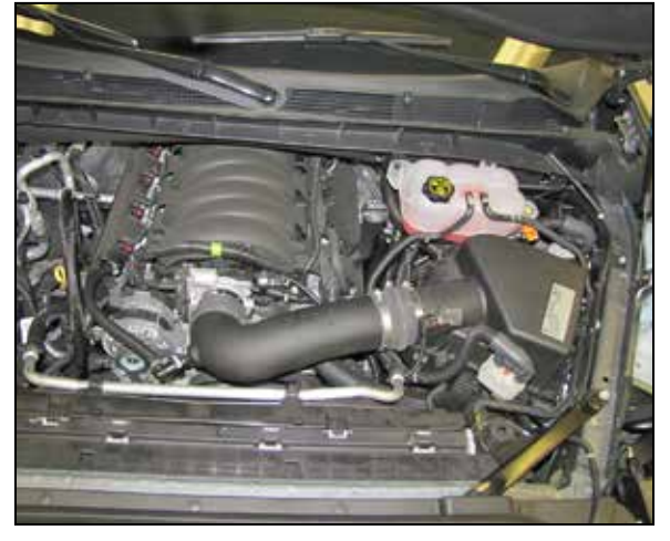
11. Reconnect the vehicle's negative battery cable. Double check to make sure everything is tight and properly positioned before starting the vehicle.

12. It will be necessary for all K&N<sup>®</sup> high flow intake systems to be checked periodically for realignment, clearance and tightening of all connections. Failure to follow the above instructions or proper maintenance may void warranty.