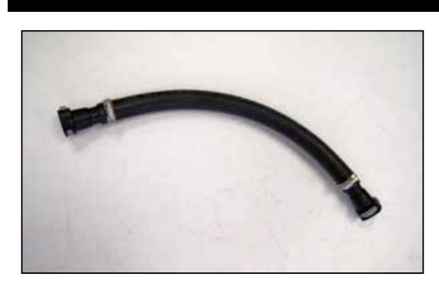
10. Assemble the crank case vent hose assembly as shown.