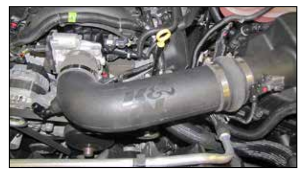
9. Install the K&N® intake tube into the coupler at the air filter housing and then into coupler on the throttle body, adjust the tube for best fit and then secure with the provided hose clamps.

NOTE: Plastic NPT fittings are easy to cross thread. Install the vent fitting "hand" tight, then turn it two complete turns with a wrench.