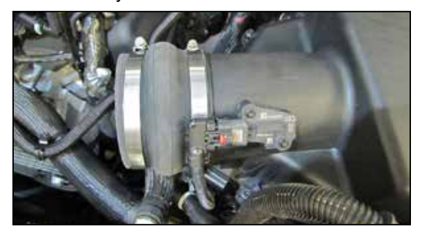
6. Install the provided hump coupler (08418) onto the air filter housing and secure with the provided hose clamp.