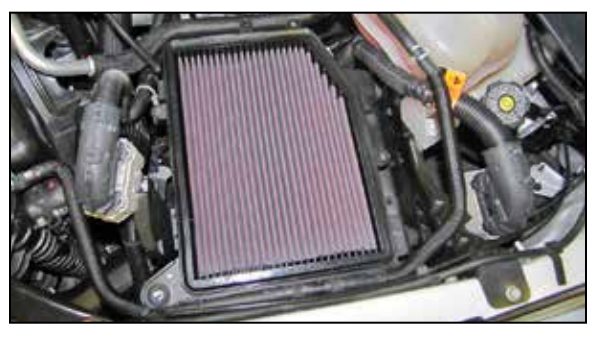
5. Remove the upper air filter housing and replace the factory air filter with the provided K&N® air filter and then reinstall the upper housing and secure with the factory hardware.

NOTE: K&N Engineering, Inc., recommends that customers do not discard factory air intake.