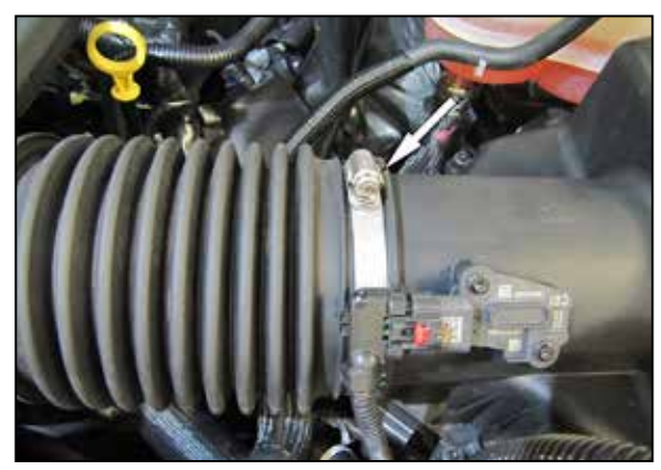
3. Loosen the hose clamp that secures the intake tube to the air filter housing.