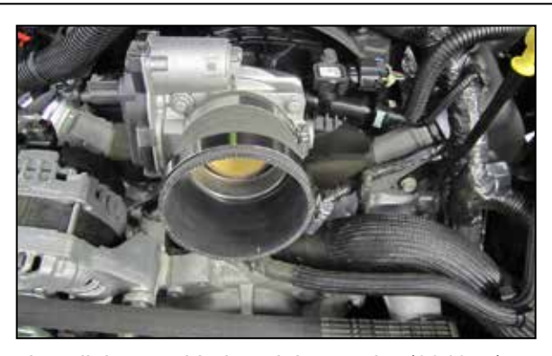
7. Install the provided straight coupler (084055) onto the throttle body and secure with the provided hose clamp.