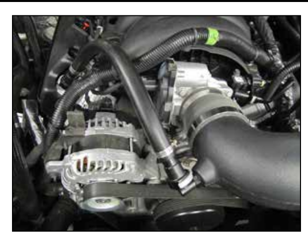
11. Connect the crankcase vent hose assembly to the fitting in the K&N® intake tube and to the valve cover port.