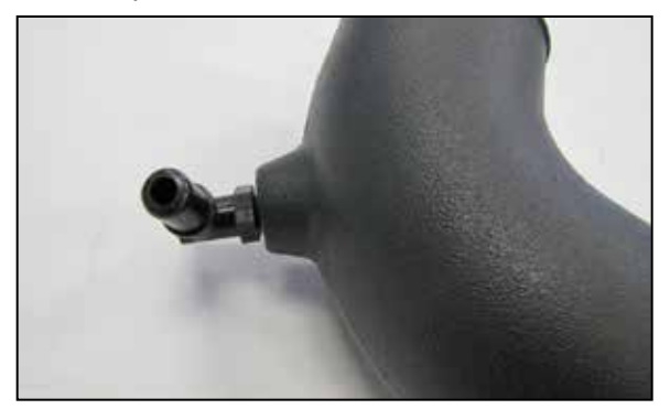
8. Install the provided 90^{\rm o} vent fitting into the K&N ^{\rm o} intake tube as shown.

NOTE: Plastic NPT fittings are easy to cross thread. Install the vent fitting "hand" tight, then turn it two complete turns with a wrench.