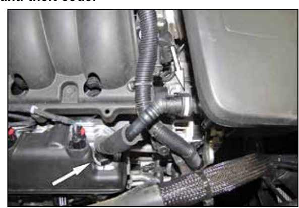
2. Depress the locking tabs and disconnect the crank case vent line from the intake plenum and valve cover.

NOTE: Disconnecting the negative battery cable erases pre-programmed electronic memories. Write down all memory settings before disconnecting the negative battery cable. Some radios will require an anti-theft code to be entered after the battery is reconnected. The anti-theft code is typically supplied with your owner's manual. In the event your vehicles anti-theft code cannot be recovered, contact an authorized dealership to obtain your vehicles anti-theft code.