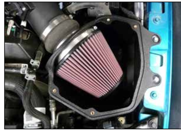
17. Install the K&N air filter onto the adapter and secure with the provided hose clamp.