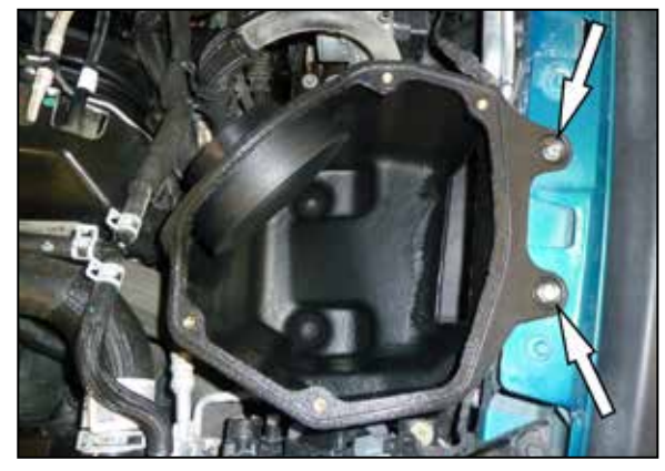
8. Set the K&N air filter housing assembly into the vehicle and secure with the provided hardware.

7. Install the filter adapter into the K&N air filter housing and secure with the provided hardware.