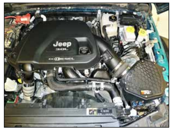
19. Reconnect the vehicle's negative battery cable. Double check to make sure everything is tight and properly positioned before starting the vehicle.

20. It will be necessary for all K&N<sup>®</sup> high flow intake systems to be checked periodically for realignment, clearance and tightening of all connections. Failure to follow the above instructions or proper maintenance may void warranty.