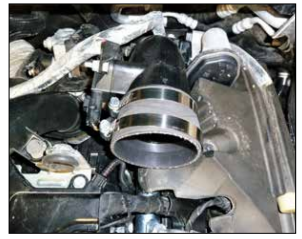
10. Install the provided straight coupler onto the turbo inlet and secure with the provided hose clamp.