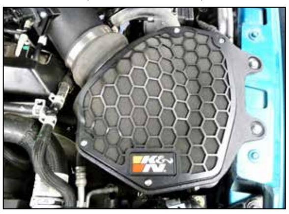
18. Assemble the foam filter and cage assembly and secure it to the air filter housing with the provided hardware.