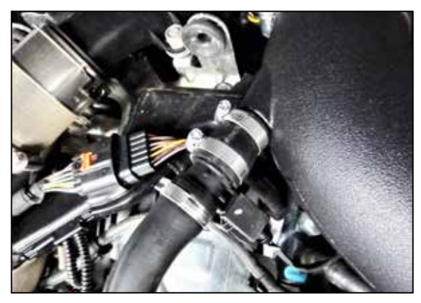
16. Using the provided hose and clamps, secure the CCV hose to the K&N intake tube.

15. Reconnect the mass air sensor electrical connection.