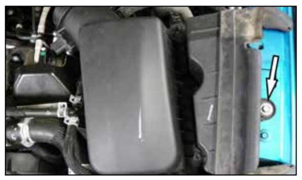
6. Remove the bolt that secures the factory air filter housing to the vehicle and then remove the housing from the vehicle.

5. Loosen the hose clamp that secures the factory intake hose to the turbo inlet, then release the plastic clamp that secures the hose to the factory air filter housing. Remove the factory intake hose from the vehicle.