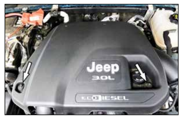
2. Remove the two bolts that secure the engine cover and then remove the engine cover from the vehicle.

3. Release the locking tab and then disconnect the mass air sensor electrical connection.