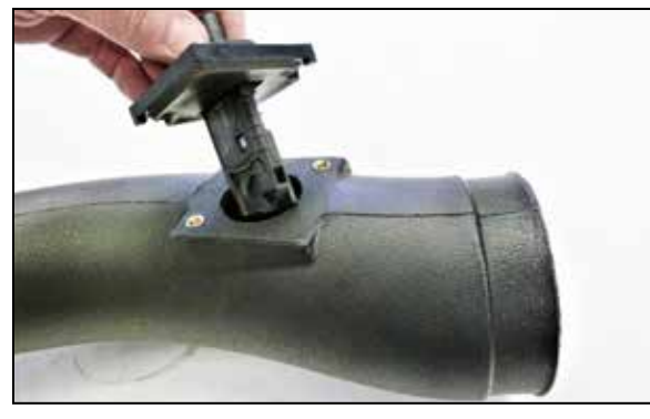
13. Install the mass air sensor assembly into the K&N intake tube and secure with the provided hardware. NOTE: be sure to install the sensor in the correct direction, see photo.

12. Install the provided CCV vent tube into the K&N intake tube as shown. NOTE: Be sure it is positioned as shown for proper function.