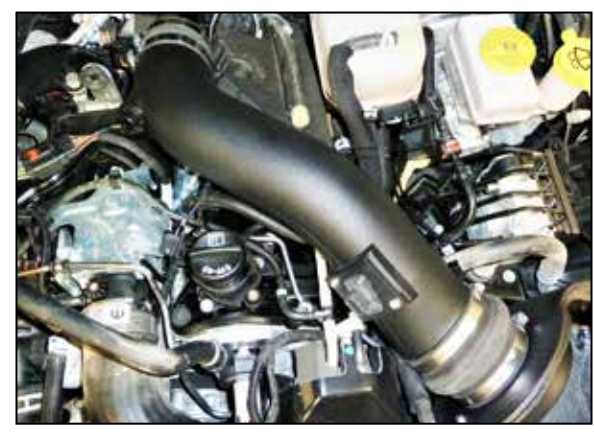
14. Install the K&N intake tube into the couplers, align for best fit and then secure the hose clamps.