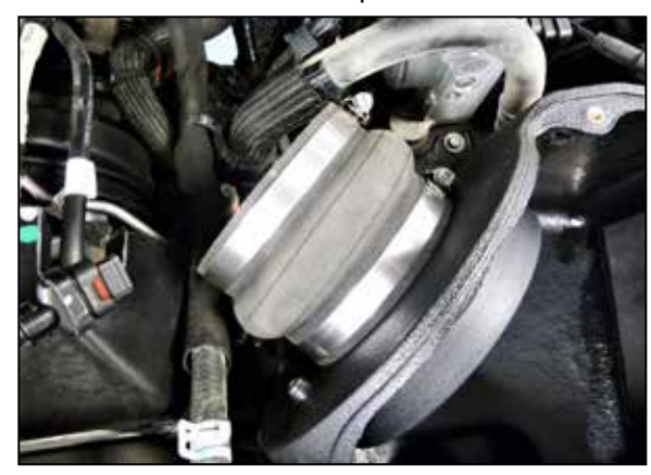
9. Install the provided hump coupler onto the filter adapter and secure with the provided hose clamps.