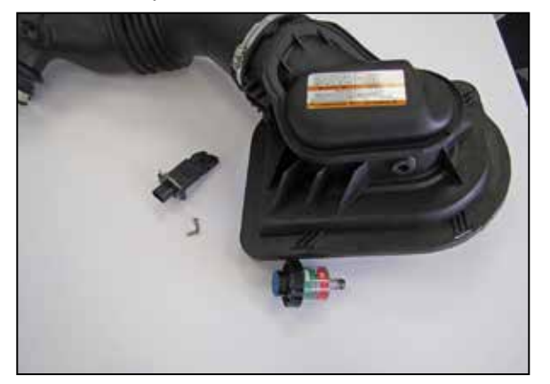
10. Remove the mass air sensor and filter minder from the factory intake tube.