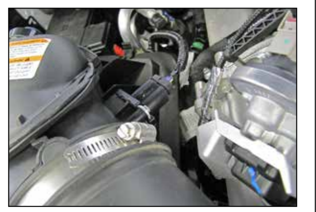
2. Disconnect the mass air sensor electrical connection.

3. Loosen the hose clamp at the turbo inlet, then release the clamps securing the air filter housing top. Remove the intake tube and air filter housing top from the vehicle.