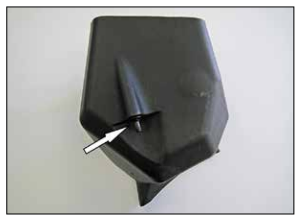
6. Using the provided hardware, secure the mounting stud to the K&N<sup>®</sup> air filter housing as shown.