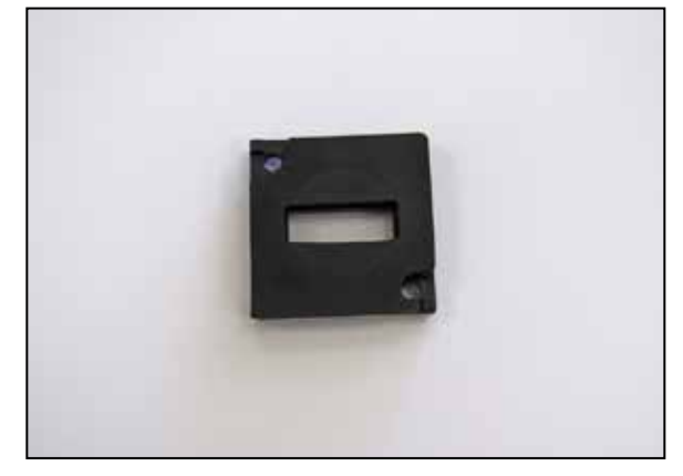
9. Install the provided gasket onto the K&N<sup>®</sup> mass air sensor adapter.

NOTE: It is an extremely tight fit past the upper lip, go slow and use caution, you will need to squeeze the filter together to get it to pass by the lip without damage.