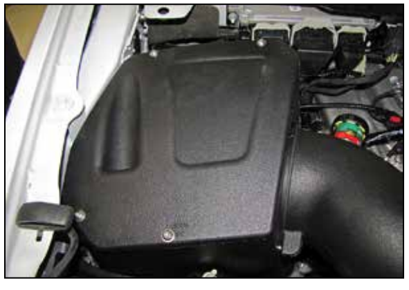
17. Install the air filter housing lid and secure with the provided hardware.

16. Install the air filter onto the K&N<sup>®</sup> intake tube and secure with the provided hose clamp.