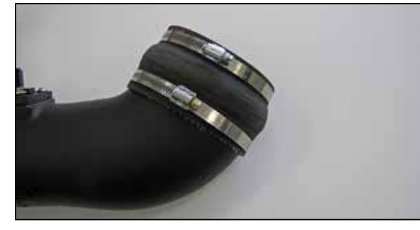
14. Install the coupling hose (08695) and hose clamps onto the intake tube and slide it on as far as possible, do not secure.