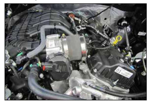
5. Install the K&N<sup>®</sup> air filter and then reinstall the air filter housing do not secure the lid at this time.

6. Install the provided coupling hose (084055) onto the throttle body and secure with the provided hose clamp.