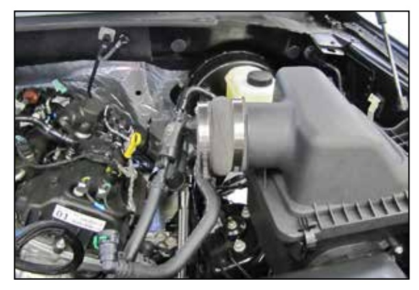
7. Install the provided coupler hose (08639) onto the air filter housing and secure with the provided hardware.