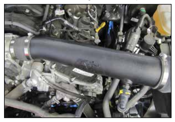
11. Connect the factory vent lines to the quick connect fittings installed into the K&N<sup>®</sup> intake tube.

10. Secure the vent hose to the K&N<sup>®</sup> intake tube with the provided mounting head tie wrap.