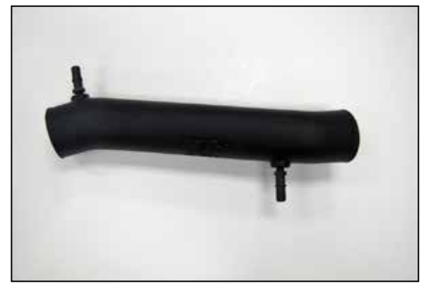
8. Install the provided quick connect fittings into the K\&N^{\mbox{\tiny $\$$}} intake tube as shown.

NOTE: Plastic NPT fittings are easy to cross thread. Install the vent fitting "hand" tight, then turn it two complete turns with a wrench.