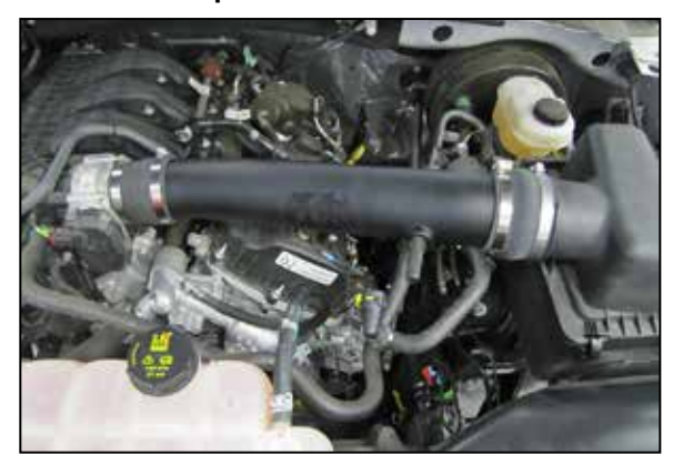
9. Install the K&N<sup>®</sup> intake tube into the Coupler at the throttle body and then onto the coupler at the air filter housing. Secure the upper air filter housing and then adjust the tube for best fit and secure with the provided hose clamps.

NOTE: Plastic NPT fittings are easy to cross thread. Install the vent fitting "hand" tight, then turn it two complete turns with a wrench.