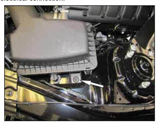
8. Remove the bolt securing the air filter housing to the inner fender and remove the air filter housing from the vehicle