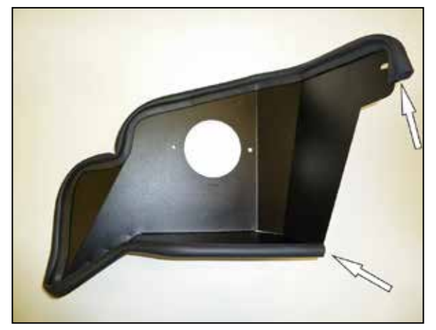
9. Install the provided edge trim onto the heat shield as shown.