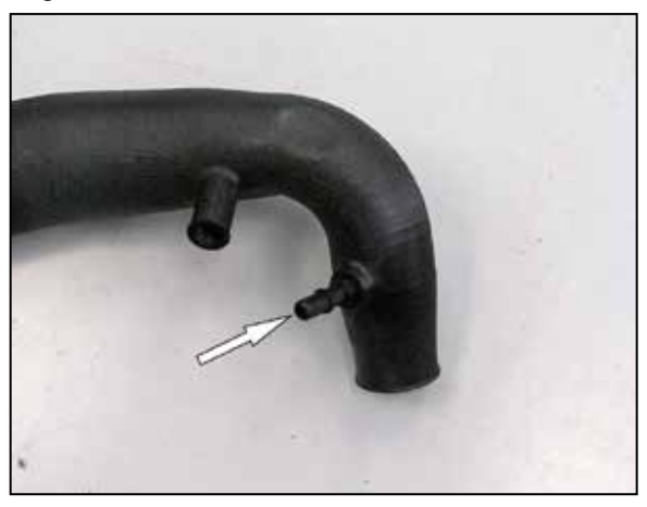
19. Install the provided quick disconnect fitting into the K&N® intake tube as shown.

NOTE: Plastic NPT fittings are easy to cross thread. Install the vent fitting "hand" tight, then turn it two complete turns with a wrench.