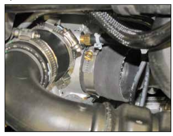
15. Install the provided hose (08638) onto the turbo and secure with the provided hose clamp.