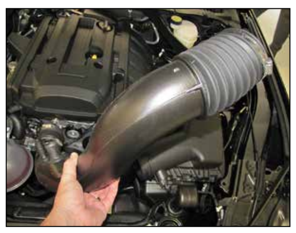
6. Remove the factory intake tube from the vehicle. NOTE: K&N Engineering, Inc., recommends that customers do not discard factory air intake.