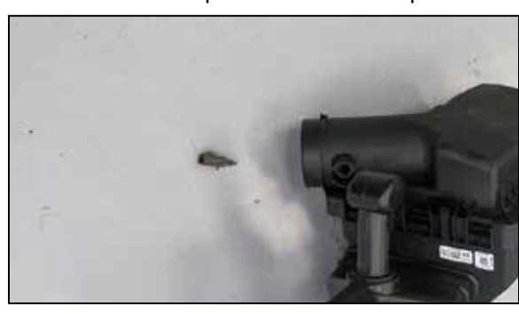
16. Remove the inlet air temperature sensor from the factory air filter housing.

NOTE: The inlet air temperature sensor is very fragile; take care while removing the sensor so as not to damage it.