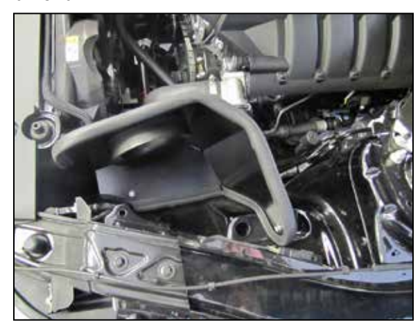
13. Install the heat shield assembly onto the inner fender and bracket and then secure with the provided hardware.