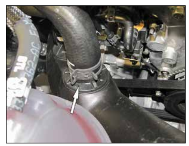
3. Using pliers, squeeze the spring clamp until it locks in the open position. Then disconnect the BOV hose from the intake tube.