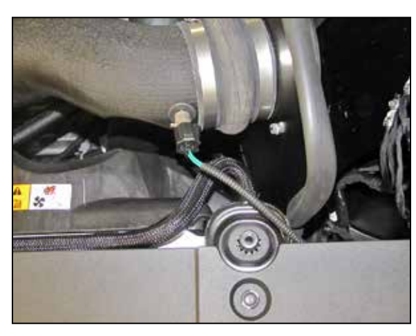
23. Connect the provided extension harness to the factory inlet air temperature sensor harness and then connect the other end to the inlet air temperature sensor as shown.