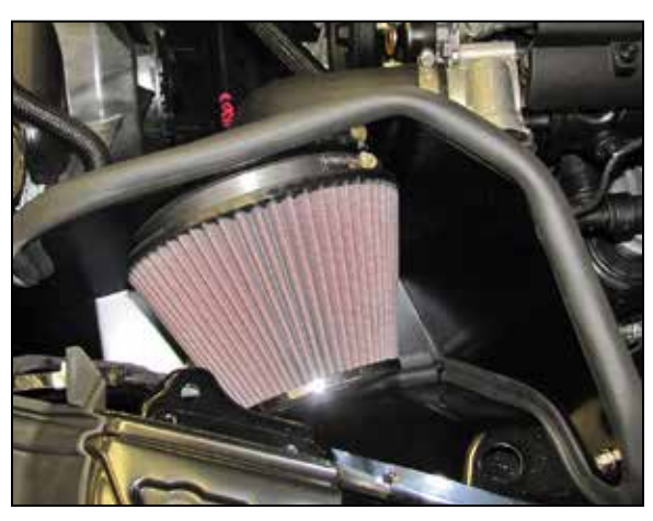
14. Install the K&N® air filter onto the filter adapter and secure with the provided hose clamp. NOTE: Drycharger® air filter wrap; part # 22-8049DK is available to purchase separately. To learn more about Drycharger® filter wraps or look up color availability please visit http://www.knfilters.com®.