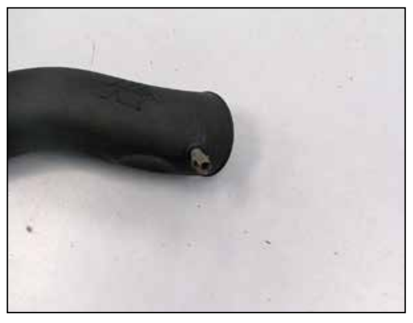
18. Remove the O-Ring from the factory temperature sensor and then install the sensor into the grommet installed into the K&N® intake tube.