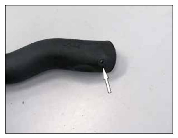
17. Install the provided grommet into the K&N<sup>®</sup> intake tube as shown.

NOTE: The inlet air temperature sensor is very fragile; take care while removing the sensor so as not to damage it.