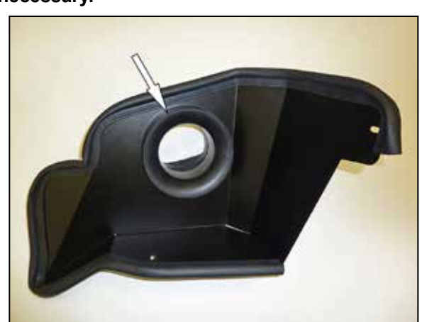
10. Install the filter adapter into the heat shield as shown.