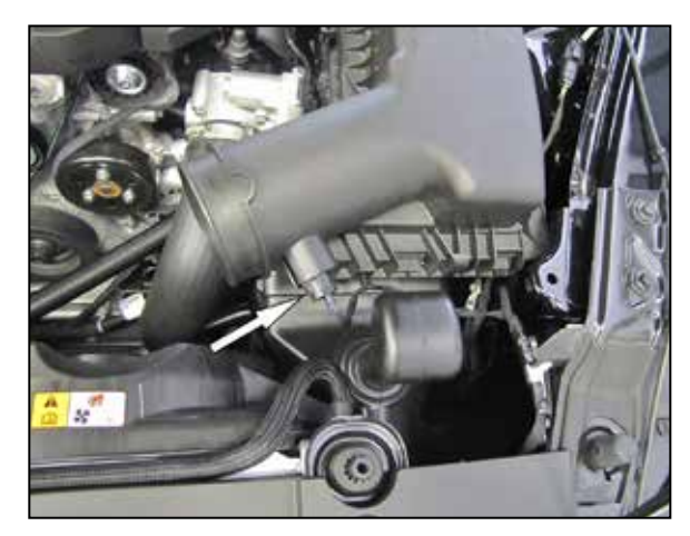
7. Disconnect the inlet air temperature sensor electrical connection.