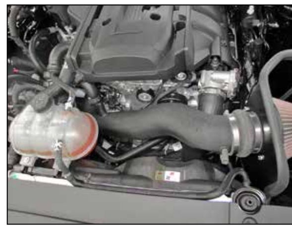
20. Slide the provided hump hose (08418) onto the end of the K&N® intake tube, then install the intake tube into the hose at the turbo inlet. Slide the hump hose into position on the filter adapter and secure the tube with the provided hose clamps.

NOTE: Plastic NPT fittings are easy to cross thread. Install the vent fitting "hand" tight, then turn it two complete turns with a wrench.