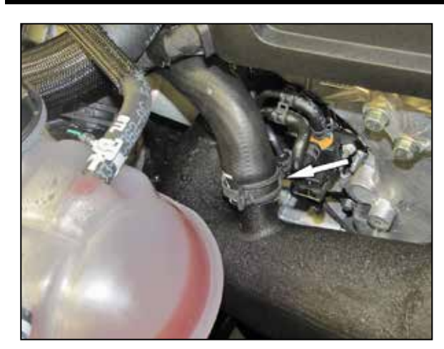
22. Install the BOV hose onto the K&N® intake tube and release the factory spring clip.