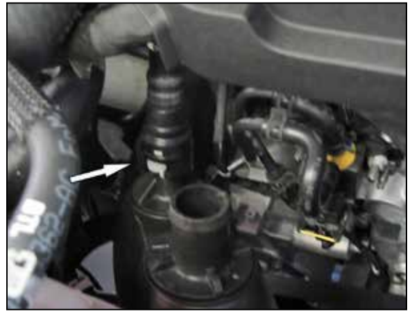
4. Release the locking ring and then disconnect the crank case vent tube from the intake tube.