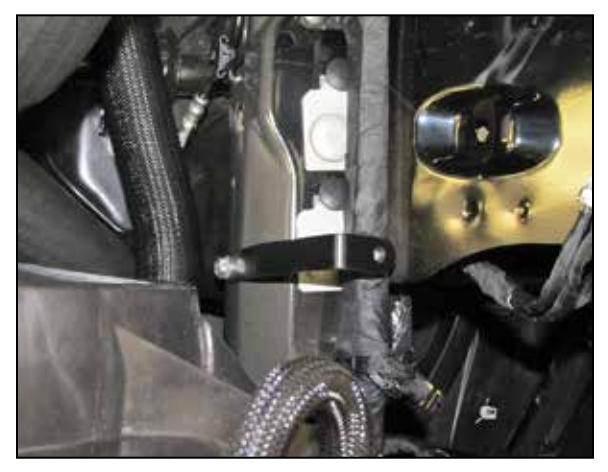
12. Install the heat shield mounting bracket onto the inner frame rail using the provided hardware. NOTE: Use the existing threaded hole in the frame rail.