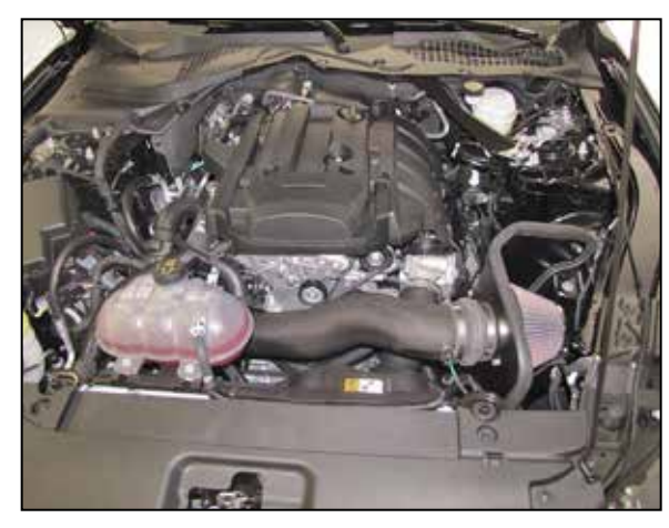
24. Reconnect the vehicle's negative battery cable. Double check to make sure everything is tight and properly positioned before starting the vehicle.

25. It will be necessary for all K&N® high flow intake systems to be checked periodically for realignment, clearance and tightening of all connections. Failure to follow the above instructions or proper maintenance may void warranty.