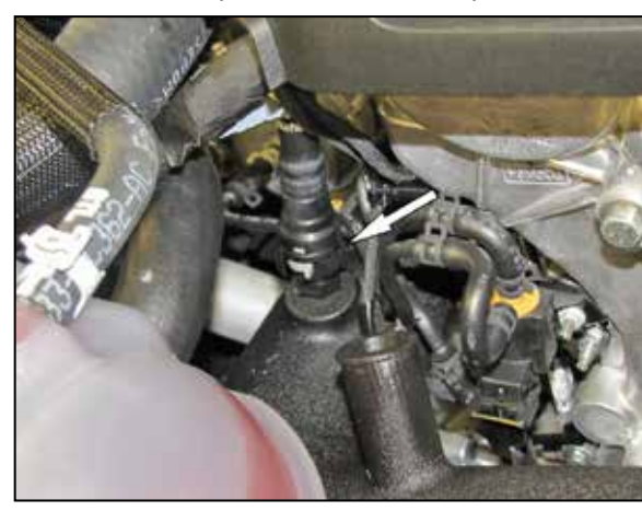
21. Connect the crank case vent hose to the fitting installed into the K&N® intake tube.