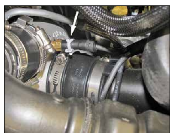
5. Loosen the hose clamp securing the intake tube to the Turbo.