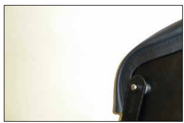
11. Install the heat shield mounting bracket (064326) onto the heat shield as shown. NOTE: Be sure to place the provided spacer between the heat shield and bracket.