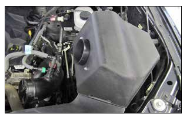
16. Install the upper filter housing onto the lower housing so the mounting studs insert into the mounting grommets.