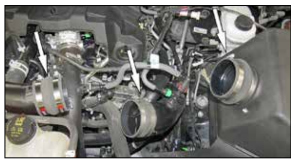
17. Install the hump coupler (08699) onto the filter adapter, hump coupler (087121) onto the upper (passenger side) turbo inlet pipe and coupler (07861) onto the lower (Drivers side) turbo inlet pipe and secure with the provided hose clamps.