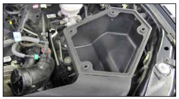
12. Install the K&N® lower filter housing assembly into the vehicle so the mounting studs insert into the factory mounting grommets. Secure the filter housing with the hardware provided to the rubber mounted stud.