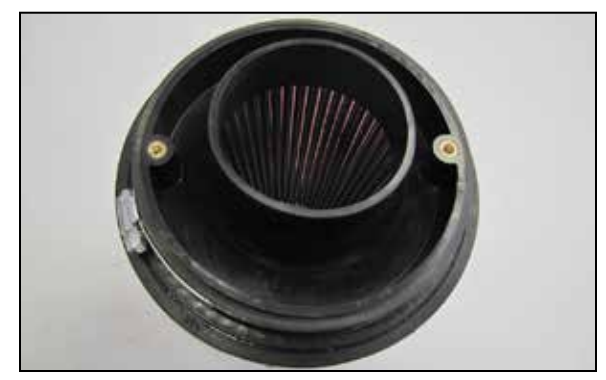
14. Install the filter adapter into the filter and secure with the provided hose clamp.