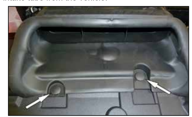
6. Remove the two clips that secure the fresh air intake duct to the core support.