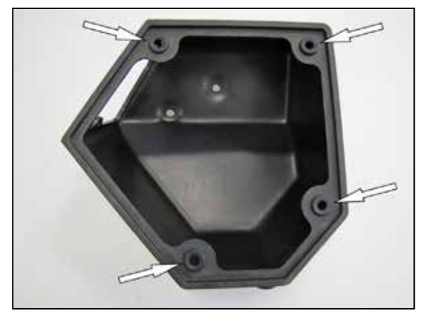
9. Install the four provided grommets into the K&N® lower filter housing.