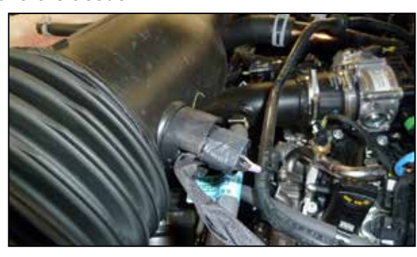
2. Disconnect the inlet air temperature sensor electrical connection.

NOTE: Disconnecting the negative battery cable erases pre-programmed electronic memories. Write down all memory settings before disconnecting the negative battery cable. Some radios will require an anti-theft code to be entered after the battery is reconnected. The anti-theft code is typically supplied with your owner's manual. In the event your vehicles anti-theft code cannot be recovered, contact an authorized dealership to obtain your vehicles anti-theft code.