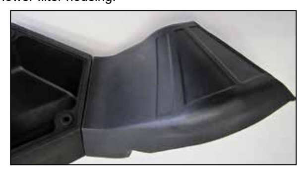
10. Attach the K&N® fresh air intake duct to the lower housing using the provided hardware.