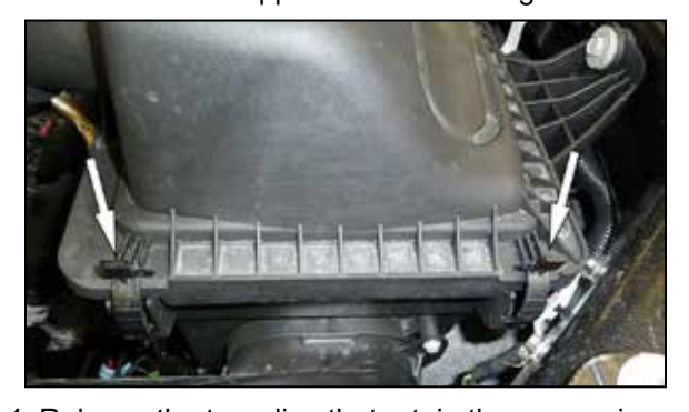
4. Release the two clips that retain the upper air filter housing and then remove the upper housing from the vehicle.