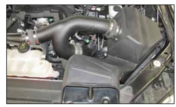
21. Reconnect the vehicle's negative battery cable. Double check to make sure everything is tight and properly positioned before starting the vehicle.

22. It will be necessary for all K&N® high flow intake systems to be checked periodically for realignment, clearance and tightening of all connections. Failure to follow the above instructions or proper maintenance may void warranty.