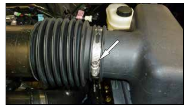
3. Loosen the hose clamp that secures the factory intake tube to the upper air filter housing.