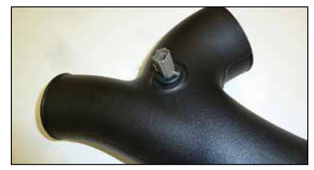
18. Remove the inlet air temperature sensor from the factory tube and remove the O-ring from the sensor. Using the provided grommet, install the inlet air temperature sensor into the K&N® intake tube.