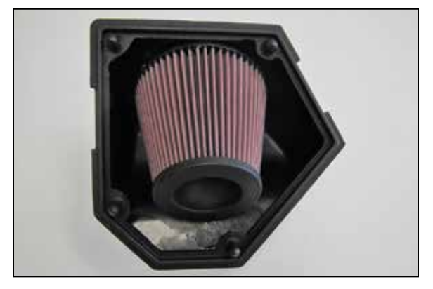
15. Install the air filter assembly into the upper air filter housing and secure with the provided hardware.