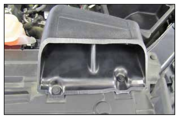
13. Secure the fresh air duct with the provided mounting clips.