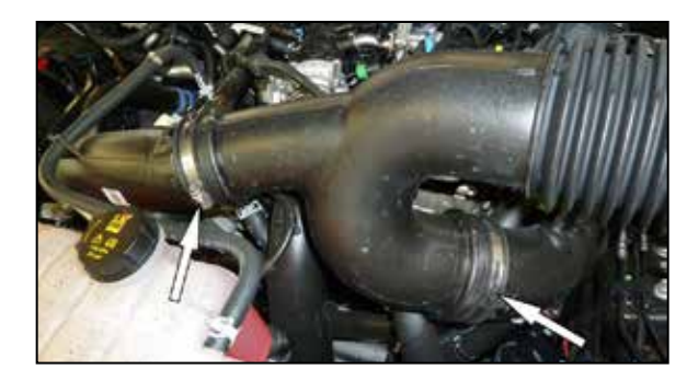
5. Loosen the hose clamps that secure the intake tube to the turbo inlet pipes and then remove the intake tube from the vehicle.