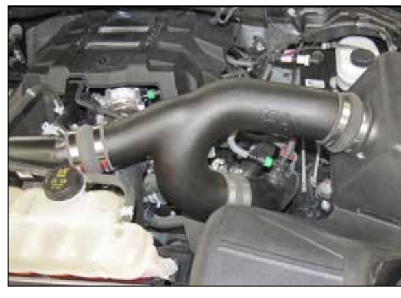
19. Install the K&N® intake tube into the couplers, align for best fit and then secure with the provided hose clamps.