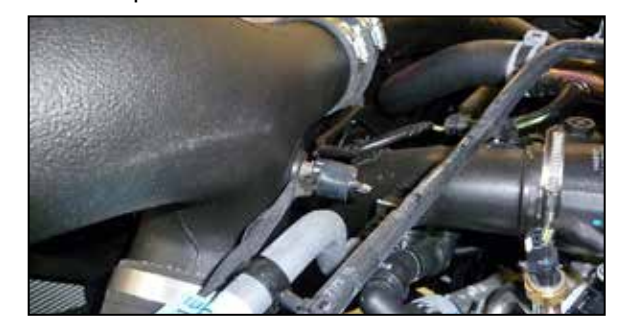
20. Reconnect the inlet air temperature sensor electrical connection.