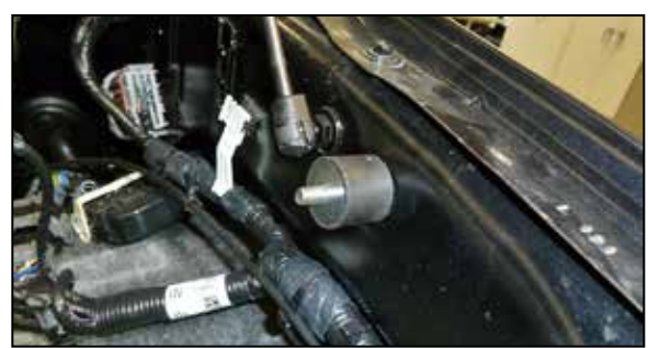
11. Install the provided rubber mounted stud into the factory filter housing mounting location as