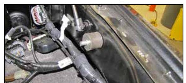
11. Install the rubber mounted stud into the factory inner fender air filter housing mounting location as