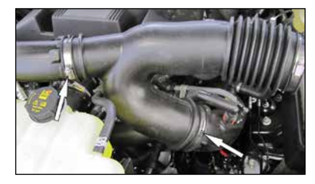
5. Loosen the two remaining hose clamps that secure the factory intake tube to the turbo inlet pipes and then remove the intake tube from the vehicle.

NOTE: K&N Engineering, Inc., recommends that customers do not discard factory air intake.