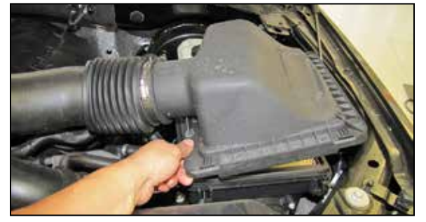
4. Release the two retaining clips that secure the upper air filter housing and then remove the upper housing from the vehicle.

NOTE: K&N Engineering, Inc., recommends that customers do not discard factory air intake.