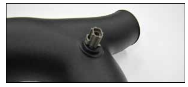
18. Remove the inlet air temperature sensor from the factory intake tube and remove the O-ring from the sensor. Using the provided grommet, install the inlet air temperature sensor into the K&N® intake tube as shown.