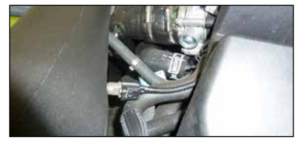
20. Reconnect the inlet air temperature sensor electrical connection using the provided extension

NOTE: Use the provided tie wraps to secure the inlet temperature sensor electrical connection as necessary.