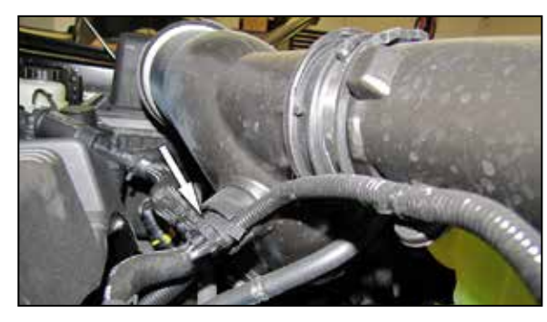
2. Disconnect the inlet air temperature sensor electrical connection.

NOTE: Disconnecting the negative battery cable erases pre-programmed electronic memories. Write down all memory settings before disconnecting the negative battery cable. Some radios will require an anti-theft code to be entered after the battery is reconnected. The anti-theft code is typically supplied with your owner's manual. In the event your vehicles anti-theft code cannot be recovered, contact an authorized dealership to obtain your vehicles anti-theft code.