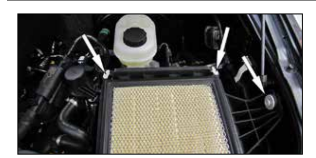
7. Disconnect the wiring harness and purge solenoid from the lower air filter housing if equipped. Remove the bolt that secures the lower air filter housing to the inner fender and then remove the lower housing from the vehicle.