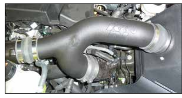
19. Install the K&N® intake tube into the couplers for the turbo inlet pipes and the filter adapter, adjust the tube for best fit and then secure with the provided hose clamps.