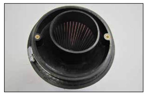
13. Install the filter adapter into the filter and secure with the provided hose clamp.