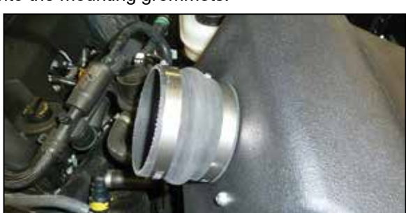
16. Install the provided hump coupler (08699) onto the filter adapter and secure with the provided hose clamp.