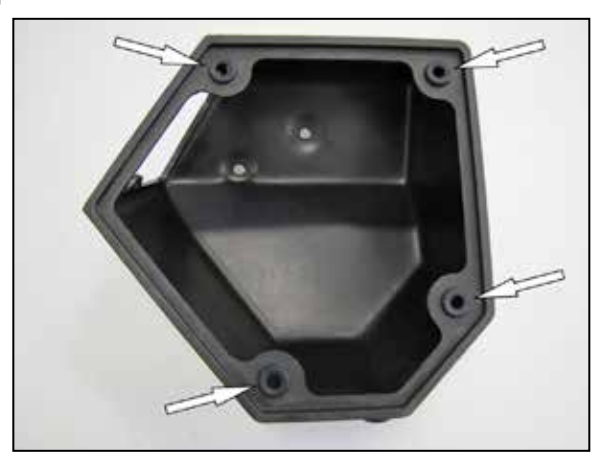
9. Install the four mounting grommets provided into the K&N® lower air filter housing as shown.