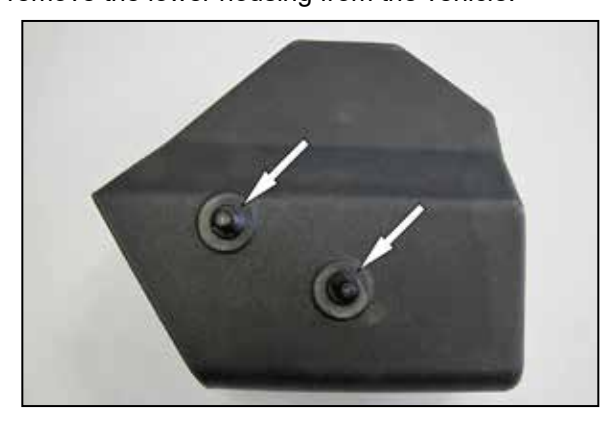
8. Install the two mounting studs provided into the K&N® lower air filter housing as shown using the provided hardware.