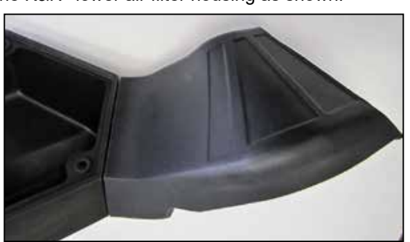
10. Using the provided hardware, secure the K&N® fresh air duct to the lower housing as shown.