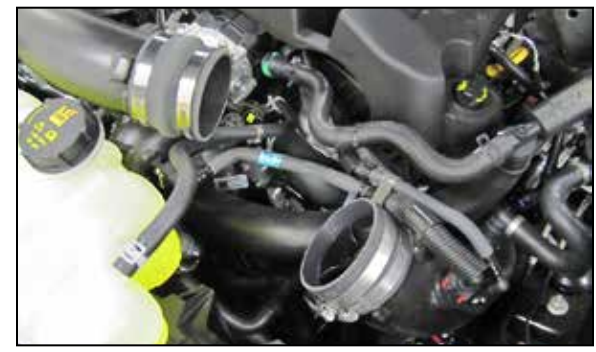
17. Install the provided hump coupler (087121) onto the upper (passenger side) turbo inlet pipe and coupler (08761) onto the lower (Drivers side) turbo inlet pipe and secure with the provided hose clamps.