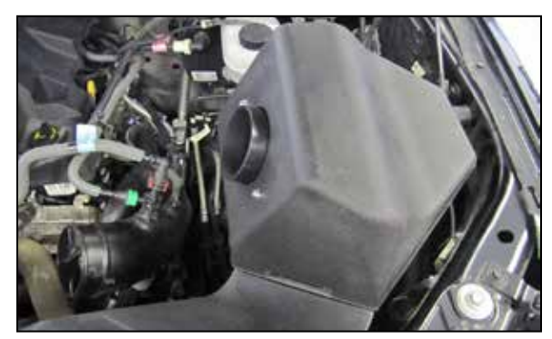
15. Install the K&N® lid/filter assembly onto the lower filter housing so the mounting studs engage into the mounting grommets