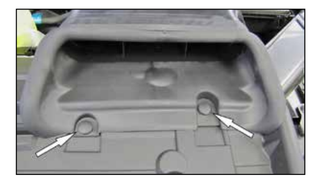
6. Release the two clips that secure the factory fresh air intake duct to the core support.