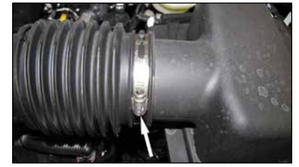
3. Loosen the hose clamp that secures the factory intake tube to the factory upper air filter housing.