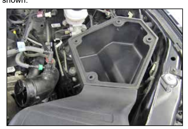
12. Install the K&N® lower air filter housing assembly into the vehicle so the mounting studs insert into the factory mounting grommets and it aligns with the rubber mounted stud installed into the inner fender. Secure the assembly with the hardware and clips provided.