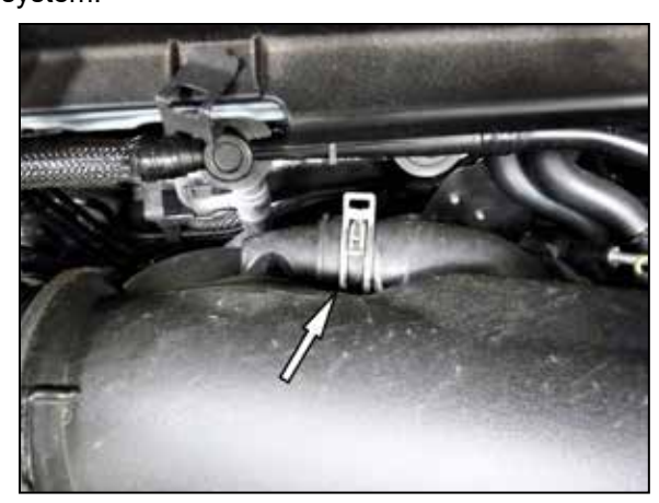
10. Release the spring clamp that secures the BOV hose to the factory intake tube and disconnect the BOV hose from the intake tube. Remove the complete stock intake tube from the vehicle.