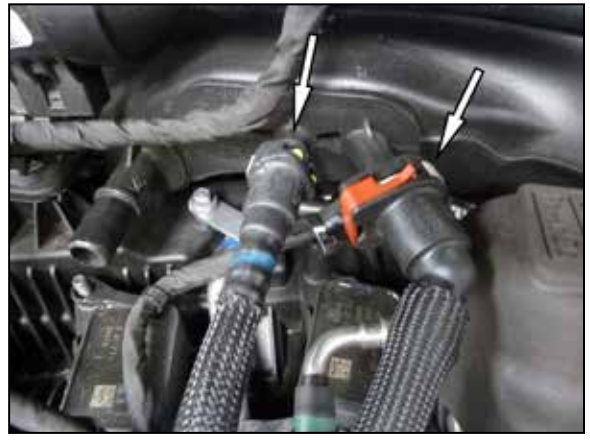
8. Release the red and yellow safety lock clips on the ejector vent lines and then release the clips that secure the ejector lines and disconnect them from the intake tube.