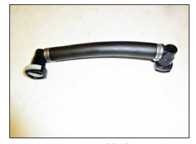
22. Assemble the provided CCV fittings and hose as shown.