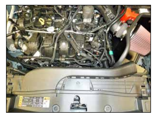
27. Reinstall the factory fresh air duct and secure with the factory pushpins.