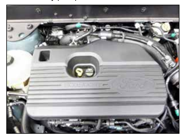
28. Reinstall the engine cover and secure with the factory hardware.