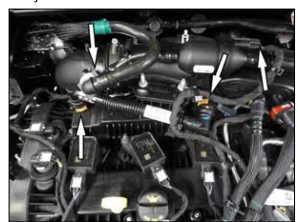
7. Disconnect the electrical connection to the sensor shown, then disconnect the engine side connection for the vent and set the assembly aside. This part will be reused with the K&N intake system. Disconnect the CCV connections on the valve cover and intake tube. NOTE: The connectors with the orange locking mechanism are none serviceable and cannot be reused after removal. They will need to be cut apart using side cutters to remove the outer shell. New connectors are supplied with the K&N intake system.