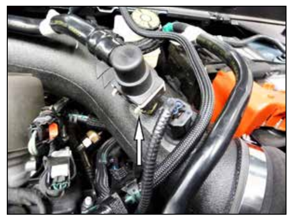
25. Reinstall the factory vent, secure the safety lock and reconnect the electrical connection.