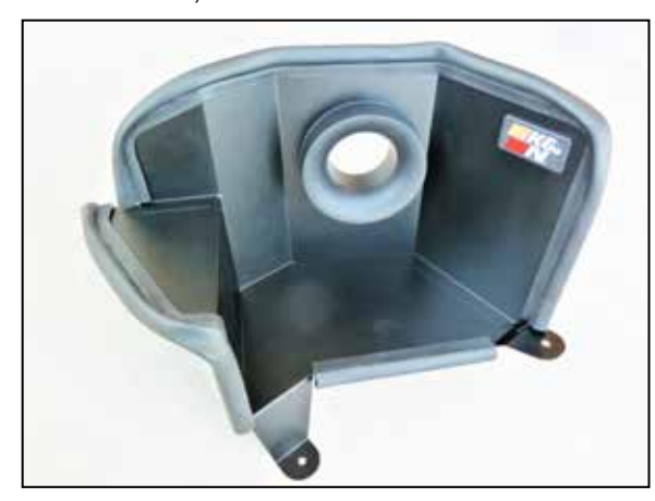
13. Using the provided hardware secure the filter adapter into the heat shield as shown. Install the K&N badge into the holes of the heat shield.