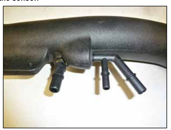
19. Install the remaining CCV fitting into the K&N intake tube as shown. Install the provided ejector fitting into the K&N intake tube using the provided grommet.