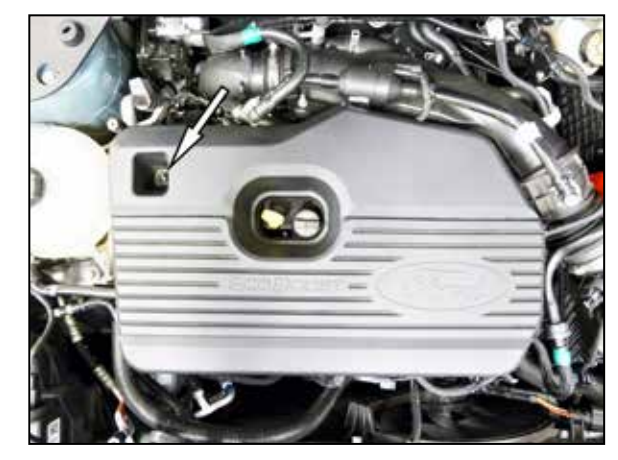
4. Remove the hardware that secures the engine cover and then remove the cover from the engine.