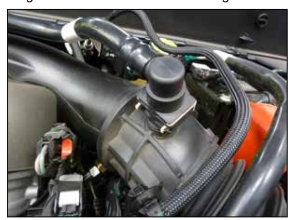
6. Release the white safety lock clip and then release the clip that secures the vent line to the factory intake tube and disconnect.