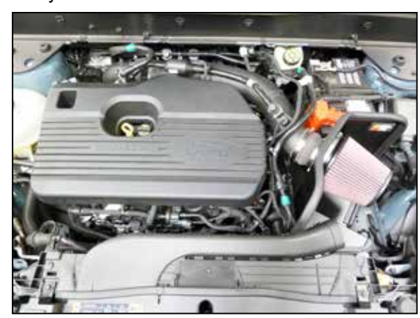
29. Reconnect the vehicle's negative battery cable. Double check to make sure everything is tight and properly positioned before starting the vehicle.

30. It will be necessary for all K&N® high flow intake systems to be checked periodically for realignment, clearance and tightening of all connections. Failure to follow the above instructions or proper maintenance may void warranty.