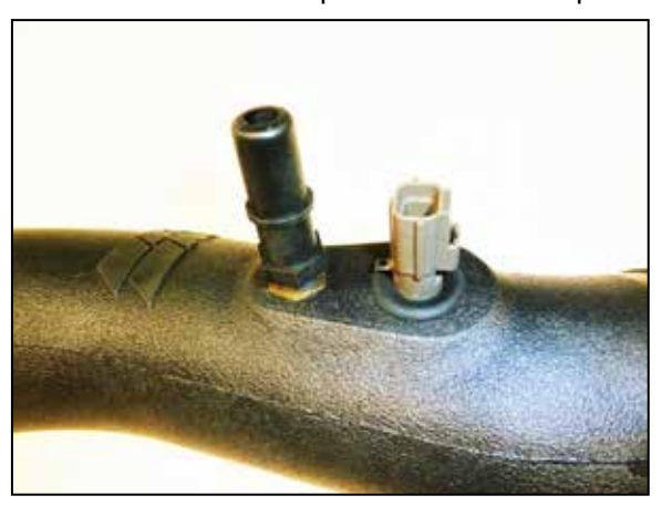
18. Remove the IAT sensor from the factory air filter housing, remove the O-ring from the sensor and then install the sensor into the K&N intake tube using the provided grommet. Install the provided CCV fitting into the K&N intake tube. NOTE: The IAT sensor is fragile, use caution while handling the sensor.