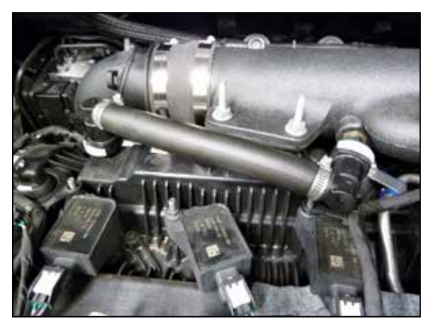
23. Install the CCV assembly onto the valve cover port and the fitting installed into the K&N intake tube.