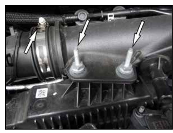
9. Loosen the hose clamp that secures the factory intake tube to the turbo inlet. Remove the hardware that secures the factory intake tube to the engine. This hardware will be reused with the K&N intake system.