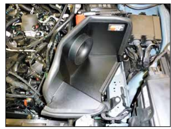
15. Install the heat shield into the vehicle so the mounting posts insert into the factory air filter housing mounting grommets.