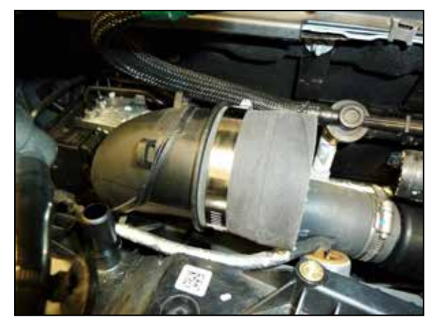
17. Install the provided step coupler onto the turbo inlet and secure with the provided hose clamp.