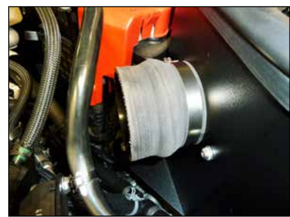
16. Install the provided hump hose onto the filter adapter and secure with the provided hose clamp.