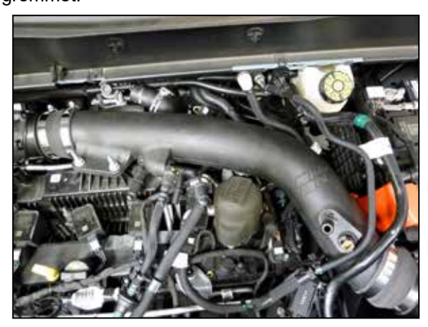
20. Install the K&N intake tube into the couplers at the filter adapter and turbo inlet, adjust the tube for best fit and secure with the provided hose clamp and factory hardware.