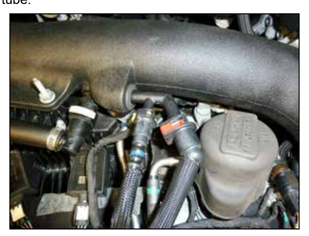
24. Connect the ejector line fittings to the ejector and secure the factory retaining locks.