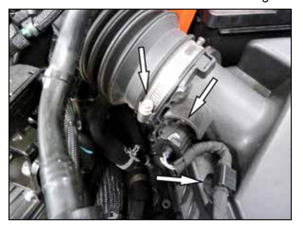
5. Loosen the hose clamp that secures the factory intake tube to the air filter housing. Disconnect the IAT sensor electrical connection and unhook the wiring harness from the air filter housing.