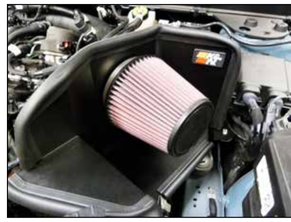
26. Install the K&N air filter and secure with the provided hose clamp.