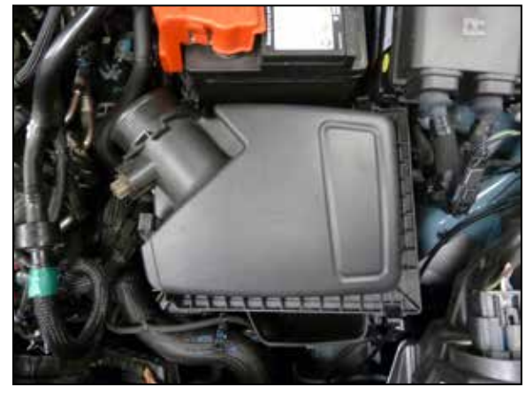
11. Lift up the factory air filter housing to dislodge it from the mounting grommets and remove it from the vehicle.