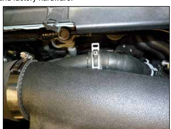
21. Connect the BOV hose too the K&N intake tube and secure with the factory spring clamp.