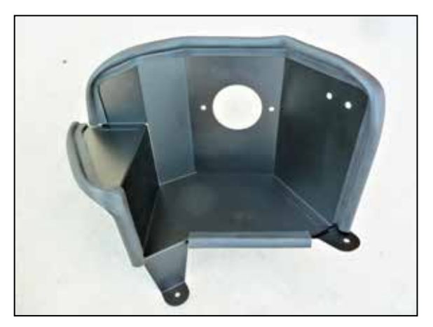
12. Install the edge trim onto the heat shield as shown. NOTE: the edge trim will be cut into three sections of 32", 12" and 6".