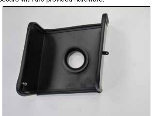
10. Install the provided edge trim onto the heat shield as shown.