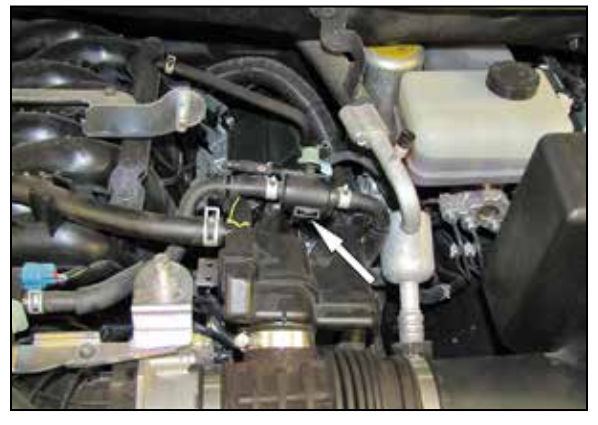
4. Unclip the EVAP line and test port from the factory intake tube.