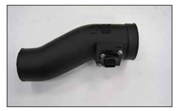
18. Install the mass air sensor assembly into the K&N® intake tube and secure with the provided hardware.

NOTE: Be sure to install the sensor with the opening towards the filter end of the tube.