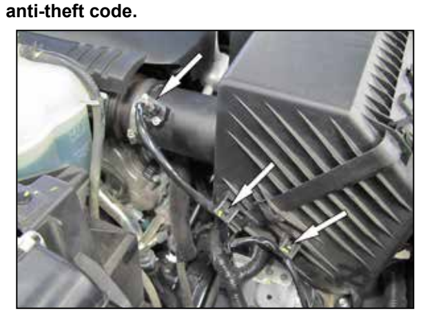
2. Disconnect the mass air sensor electrical connection and then unclip the harness from the air filter housing.

NOTE: Disconnecting the negative battery cable erases pre-programmed electronic memories. Write down all memory settings before disconnecting the negative battery cable. Some radios will require an anti-theft code to be entered after the battery is reconnected. The anti-theft code is typically supplied with your owner's manual. In the event your vehicles anti-theft code cannot be recovered, contact an authorized dealership to obtain your vehicles