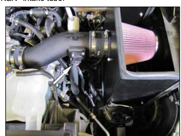
22. Reconnect the mass air sensor electrical connection.