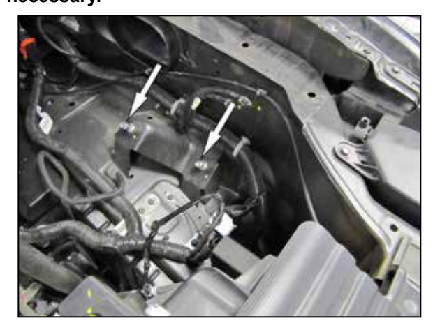
11. Remove the two-factory air filter housing mounting studs from the inner fender.