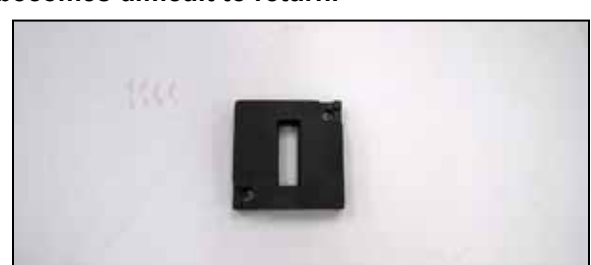
15. Install the provided gasket onto the back of the mass air sensor adapter.

NOTE: NPT fitting has tapered threads and only designed to be installed until hand tight, then tighten one rotation or when the fitting becomes difficult to return.