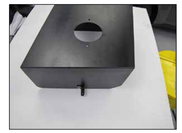
7. Install the provided mounting bracket (070066A) onto the heat shield using the provided hardware.