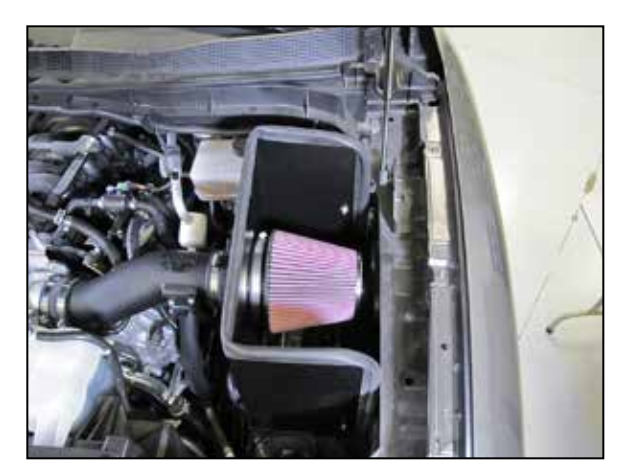
23. Install the K&N® air filter and secure with the provided hose clamp.