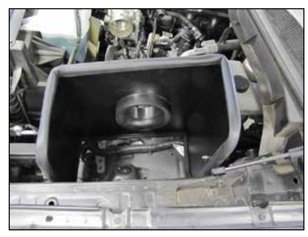
13. Install the heat shield onto the inner fender and secure with the provided hardware.