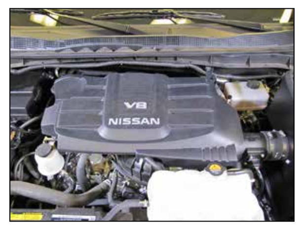
24. Reinstall the decorative engine cover.