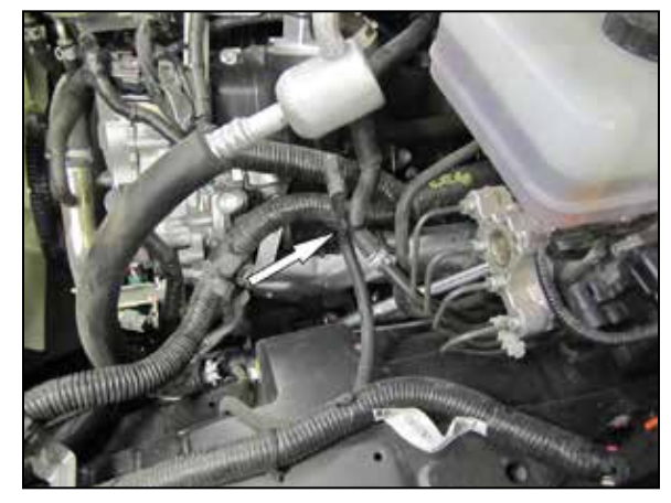
12. On 4 wheel drive models, secure the front differential vent line to the EVAP vent line.