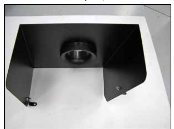
9. Install the filter adapter into the heat shield and secure with the provided hardware.