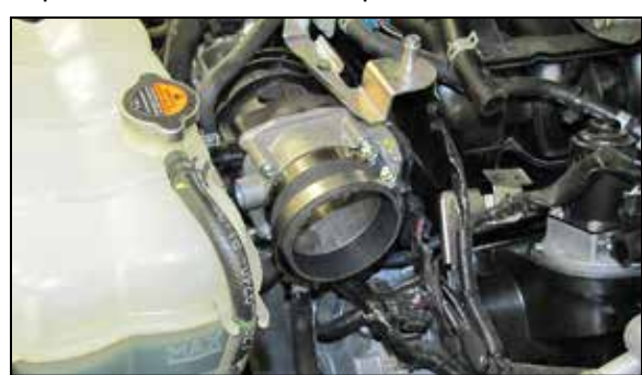
17. Install the provided coupler hose (08698) onto the throttle body and secure with the provided hose clamp.