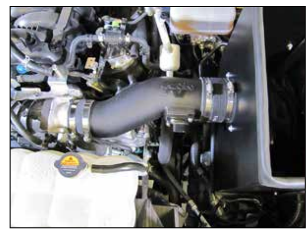
19. Install the provided coupler (08698) onto the intake tube (Do not tighten). Install the intake tube into the coupler at the throttle body and align with the filter adapter. Secure the coupler hose and intake tube with the provided hose clamps.

NOTE: Be sure to install the sensor with the opening towards the filter end of the tube.