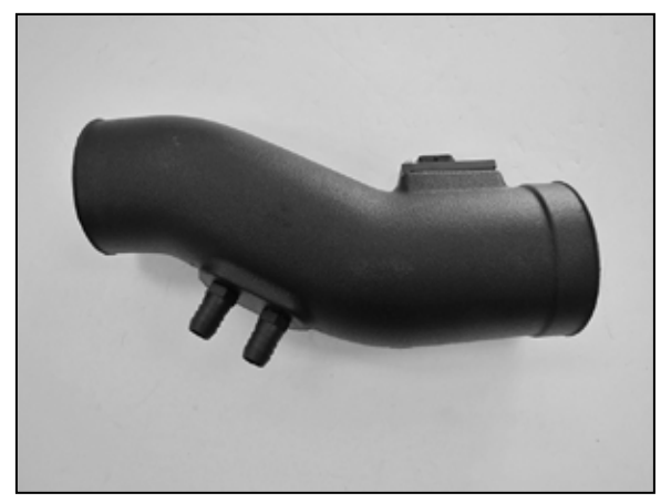
14. Install the two provided vent fittings into the K&N® intake tube as shown.

NOTE: NPT fitting has tapered threads and only designed to be installed until hand tight, then tighten one rotation or when the fitting becomes difficult to return.