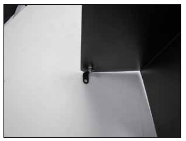
8. Install the provided mounting bracket (070712A) onto the heat shield using the provided hardware.