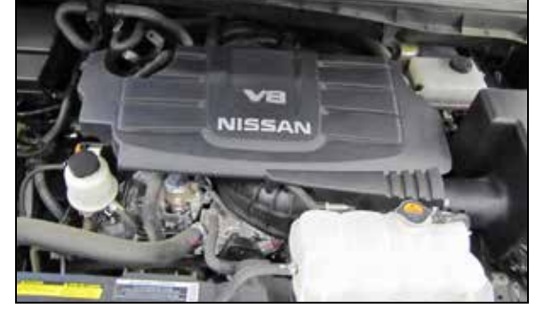
3. Lift up the engine cover and remove it from the vehicle.