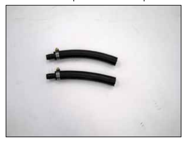
20. Install the provided union fittings into the provided vent hose and secure with the provided hose clamps.