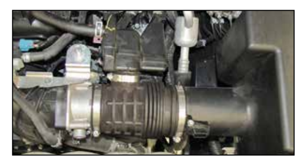
5. Loosen the hose clamp at the throttle body, unclip the upper air filter housing and disconnect the crank case vent lines from the intake tube. Remove the upper air filter housing, intake tube and factory air filter from the vehicle.