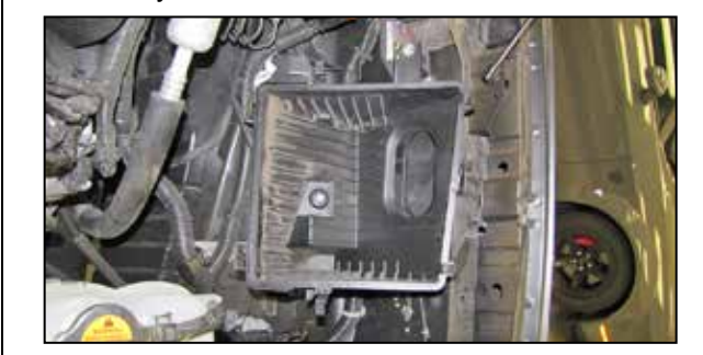
6. Remove the bolt that secures the lower air filter housing to the inner fender and then remove the lower air filter housing from the vehicle. NOTE: K&N Engineering, Inc., recommends that

NOTE: K&N Engineering, Inc., recommends that customers do not discard factory air intake.