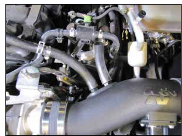
21. Install the vent fittings into the factory vent hoses and then onto the fittings installed into the K&N® intake tube.