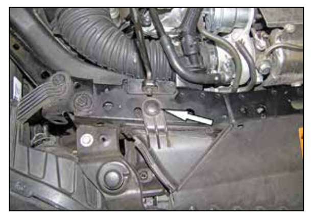
2. Remove the retaining pin the secures the fresh air intake duct.

3. Lift up the fresh air intake duct to dislodge it from the factory air filter housing and then remove it from the vehicle.