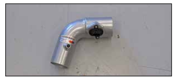
9. Install the mass air sensor into the K&N<sup>®</sup> intake tube and secure with the proper hardware.