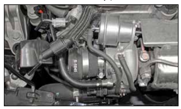
16. Install the provide coupler hose (5-1045) onto the turbo and secure with the provided hose clamp.