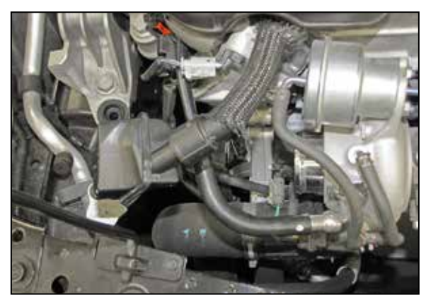
15. Reposition the crank case vent hose and chamber above the coolant by-pass hose.