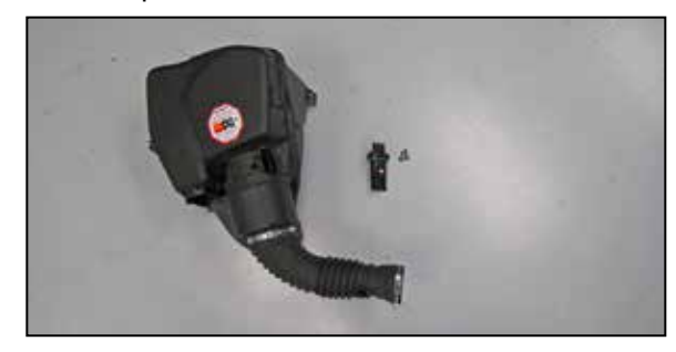
8. Remove the mass air sensor from the factory air filter housing.