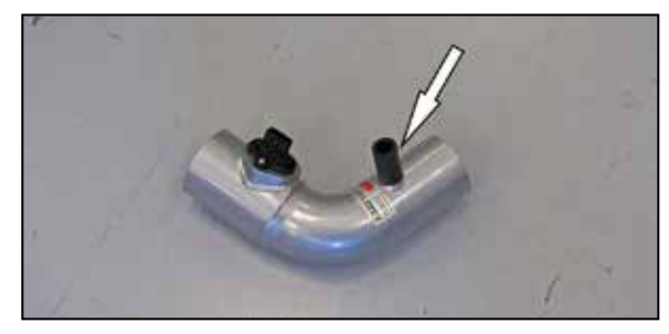
10. Install the provided crankcase vent hose onto the K&N ^{\mbox{\tiny 0}} intake tube as shown.