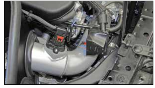
19. Reconnect the mass air sensor electrical connection.