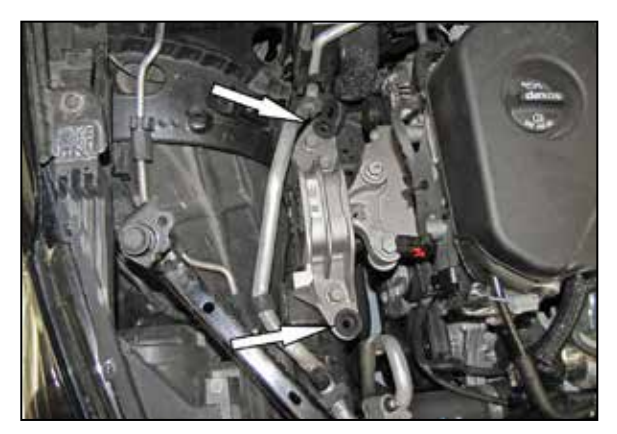
7. Be sure the factory air filter housing grommets are still in place on the mounts.