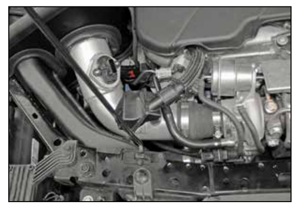
18. Install the crank case vent breather chamber into the hose installed onto the K\&N^{\otimes} intake tube.

17. Install the heat shield so the fresh air intake goes into to its correct position and the mounting studs engage with the factory grommets. Reinstall the fresh air retaining pin remove in step #2.