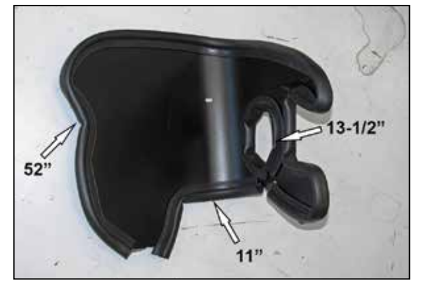
11. Cut the provided edge trim into three sections, one will be 52" long, one will be 13-1/2" long and the last one will be 11" long. Install the edge trim onto the heat shield as shown.