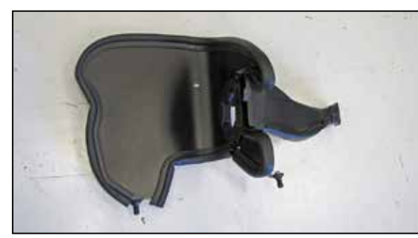
14. Install the factory fresh air duct into the heat shield as shown.