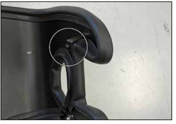
13. Install the rubber plug provided into the heat shield where shown.